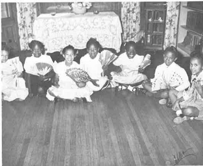
Seven Fannie Wall girls all dressed up-- 1940s photo from the East Bay Negro Historical Society's extensive collection.

The Society incorporated on June 16, 1970, the year a museum was opened. The original group formed the first Executive Board. An advisory Board of Directors was later added to the administrative struc-