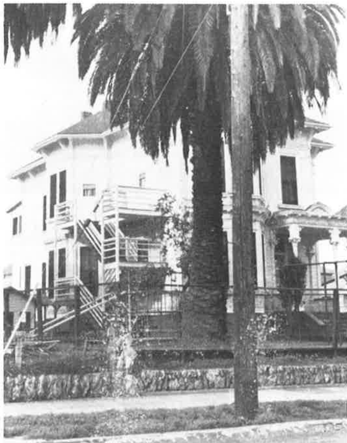
The orphanage was located at 815 Linden Street from 1928 to 1962.