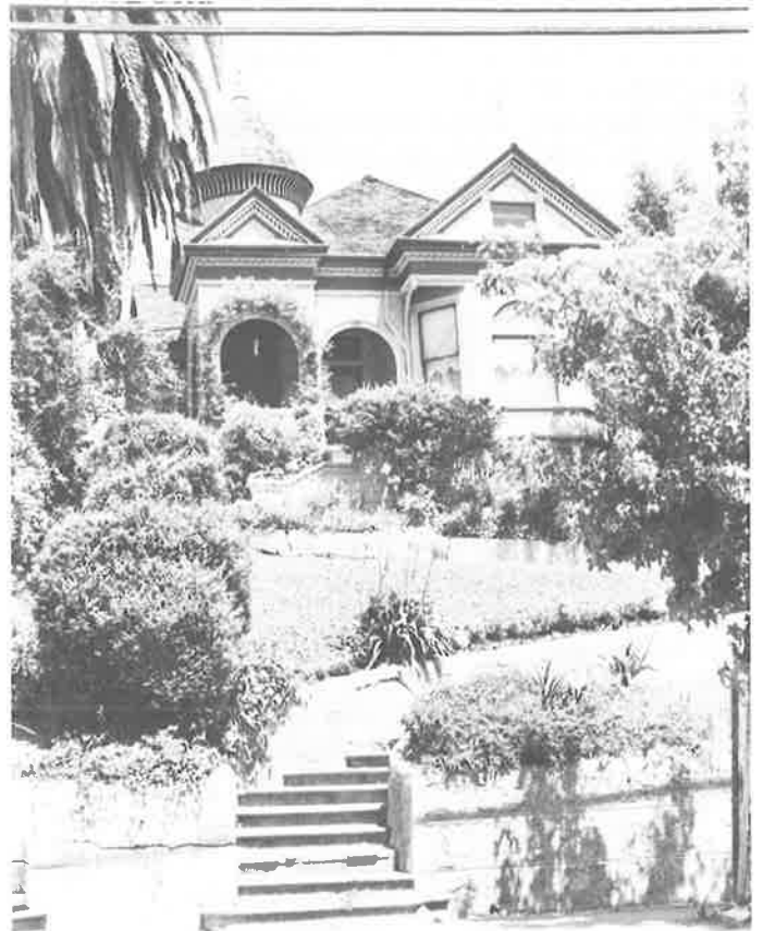
1937 8th Avenue: owner proposes landmarking