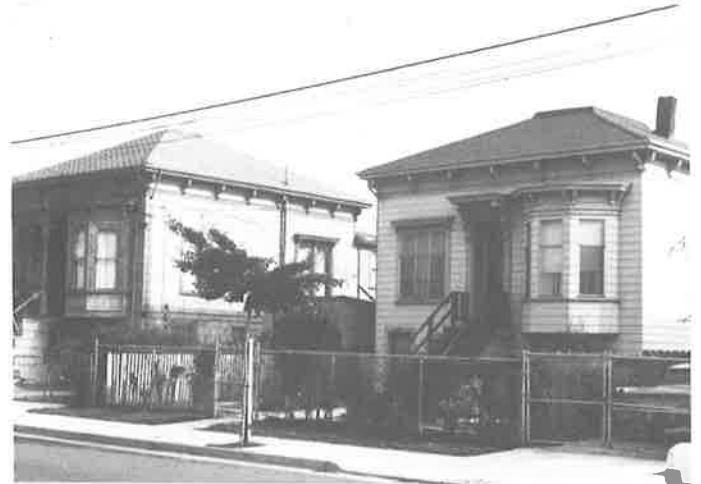
A rare pair of Italianate cottages on Chester Street: West Oakland survey delayed by budget cuts; see also p. 7.