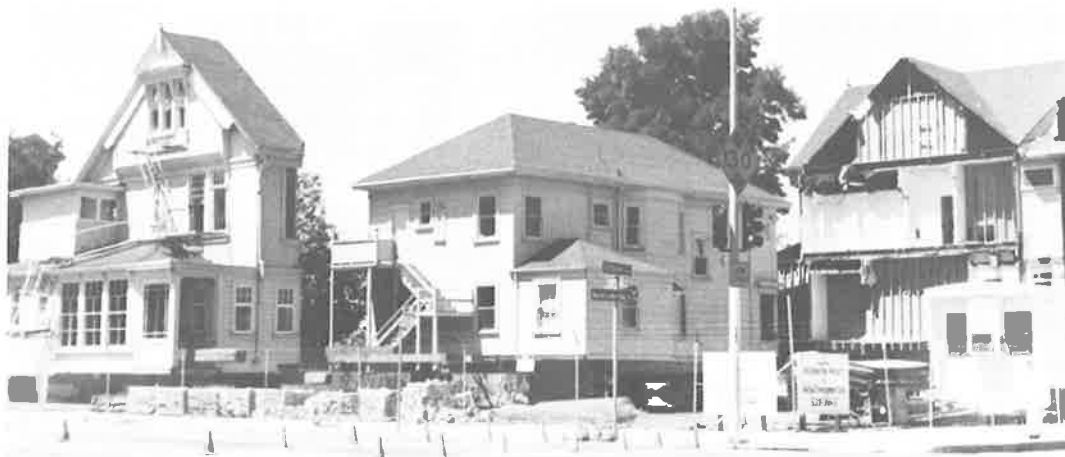
Herrick House, moved in sections from Pill Hill, achieves new spatial relation with neighbor; Landmarks Board asks for update on Preservation Park.