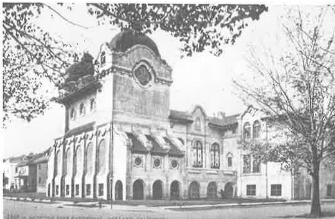
Mission Revival style Madison Street Temple: one of the buildings for which Survey's and Board's ratings differ. (1910s postcard)