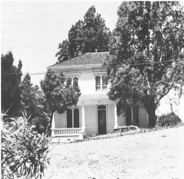
1870 farmhouse forms historic anchor of Peralta Hacienda Park