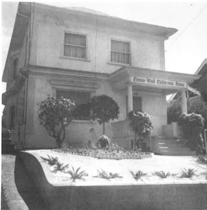
The Fannie Wall Home is now situated at 647 55th Street.