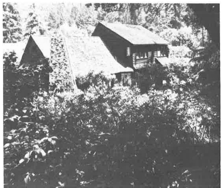
1500 Fernwood (1926) in woodland setting.