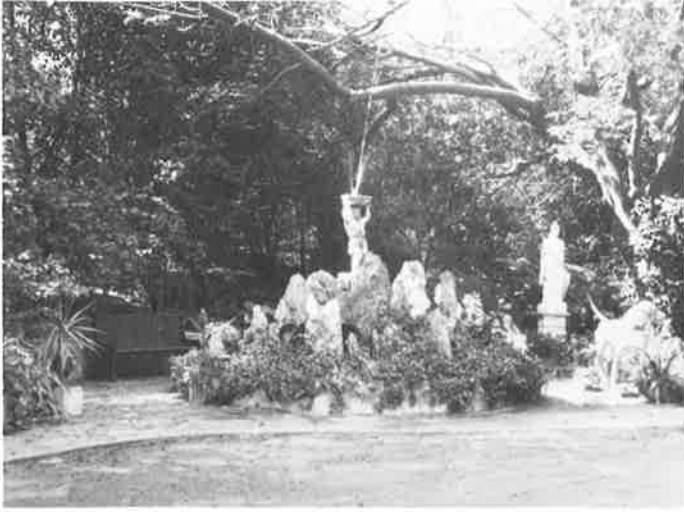
Fountain and statuary grace the famous Dingee gardens, lost to development in the 1920s.