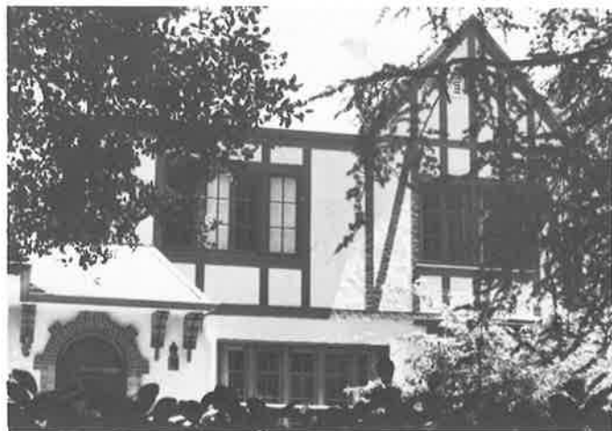
Half-timbering is one of the characteristic period costumes for Fernwood houses.