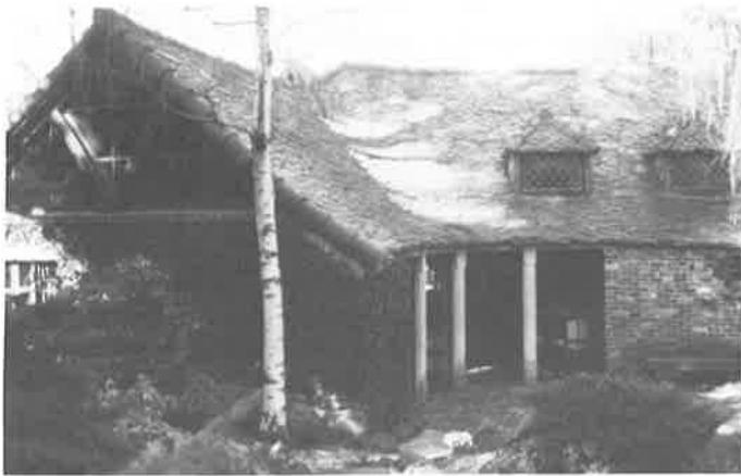
1600 Fernwood combines Mother Goose styling with modern indoor-outdoor living and concrete construction.

wooden beams. Structurally the house features double brick walls, with concrete poured between, and steel girders. The Chrysts and their builder may have been influenced by recollection of the disastrous Berkeley fire of 1923.