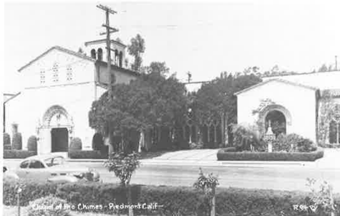
Chapel of the Chimes (Julia Morgan, 1928): landmarking halted by fear of becoming museum piece. (1940s postcard)