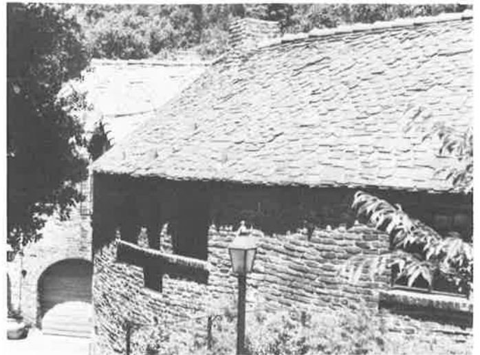
Carr Jones' William Chryst house, 1600 Fernwood Drive. Shaggy slate roof, multiple gables, and curving walls epitomize the picturesque. (Edward Phillips)

Building permit values for the houses built in the late twenties were mostly in the range of $4000 to $5000. A notable exception was the $10,000 cost of the house built by William Chryst in 1929 at 1600 Fernwood Drive.