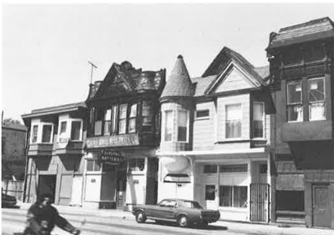
1100 block of East 12th Street: survey provides dual ratings for outstanding but altered buildings like these.

The rating system is designed to apply to all structures built prior to 1946, estimated at approximately 50,000