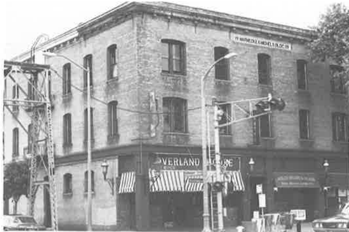
Overland House, before recent rehab: landmark process initiated.

ting buildings, and to assist the City in protection of buildings that are possible candidates for the Board's Study List. Board mentioned Fruitvale and North Oakland as important neighborhoods for this portion of the Survey.