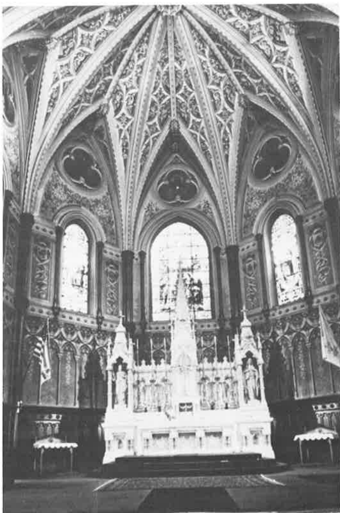
Altar and trompe-l'oeil tracery in sanctuary of St. Francis de Sales before simplification in the 1960s.