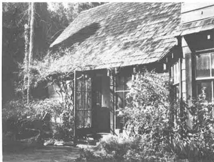
1500 Fernwood Drive, 1926: California rustic cottage in wood and glass.