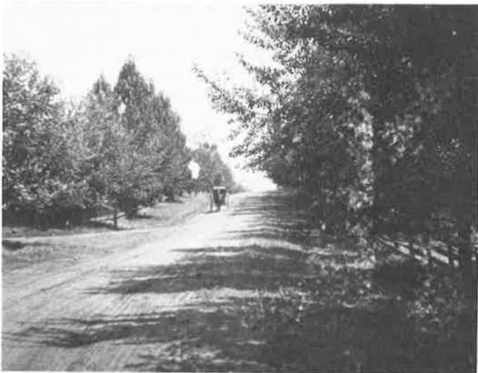
A Fernwood drive in the 1890s: neighborhood still has some of this character.

By 1923 the Fernwood tract had been added to the thousands of hill area acres controlled by the Realty Syndicate, the land development arm of the Key Route transit system owned by Smith and Havens. Building