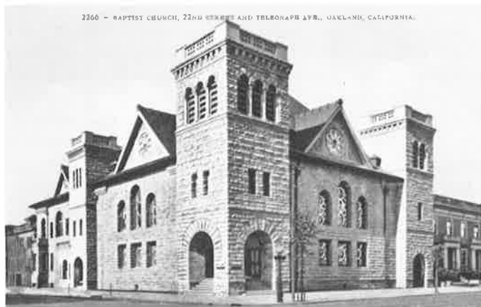
First Baptist Church (Julia Morgan et al.): Board and congregation to discuss landmarking. (postcard c. 1910)