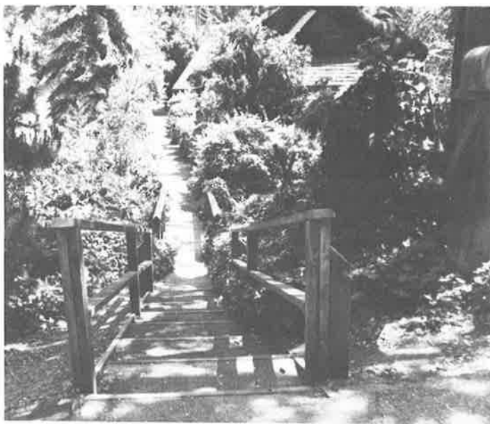
Fernwood's rustic charms.