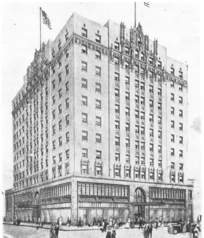
The Leamington: landmarking initiated. (postcard c.1930)