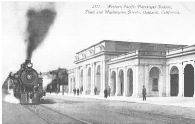
Western Pacific Depot, Oakland's first landmark: alterations reviewed. (postcard c. 1909)

The Oakland Landmarks Preservation Advisory Board meets on the third Wednesday of each month at 3:30pm in Room 211, City Hall. Meetings are open to the public. Designation of city landmarks is recommended by the Board to the City Planning Commission and City Council. Landmarks are subject to a 240-day delay in issuance of demolition permits and require design review by City Planning staff for exterior alterations. Final approval or denial of alterations is determined by the Board. Over one hundred landmarks have been designated in the ten years since the Board was created.