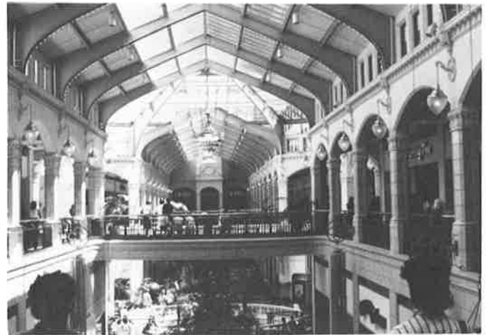
Rouse Company's Grand Avenue Mall in Milwaukee: the shape of retail to come in uptown Oakland?