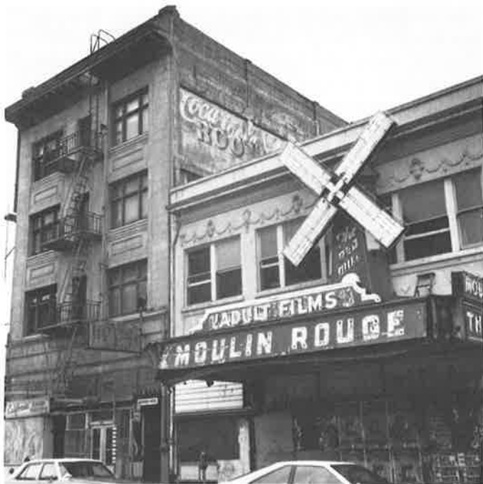
Madrone Hotel, 473 8th Street (and neighbor), in the Old Oakland District: rehab design approved for EBALDC housing project.

occupancy nonprofit housing project, with ground floor commercial space as original. Plans called for cleaning the cornice and unpainted concrete upper walls, painting the cornice and window sash, and installing new store windows with small panes and mullions, as being cheaper to replace when broken; structurally, it was already "one of the best built buildings in the neighborhood." Board suggested looking for ways to relocate the (original) fire escape, and asked to be consulted about paint selection.