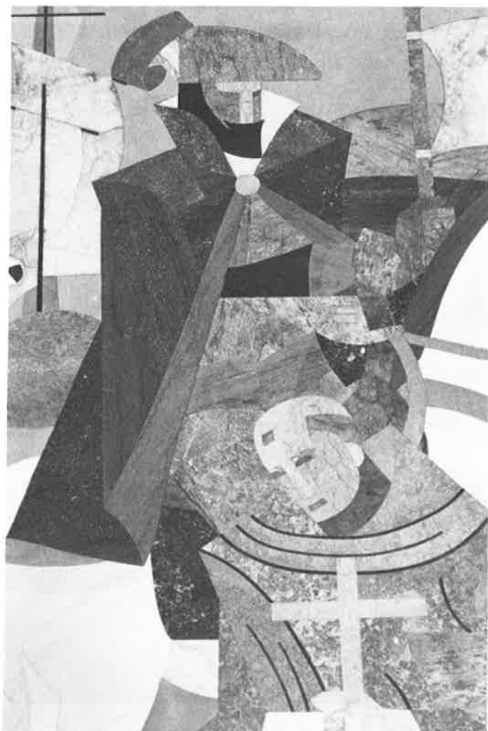
Conquistador and padre--Alameda County in the Spanish period (detail, south panel)

The north panel, in contrast, represents the American conquest of the area. A pioneer is shown astride a Western pinto pony, his fringed clothing typical of that worn by the early trappers. Instead of a Spanish galleon, a clipper ship indicates the mode of travel for the thousands of 49ers who came to the area. An American flag with 25 stars counts the number of states in the Union during this area's 19th century exploration. A pioneer mother and child are also shown. In the foreground, a boy plants a tree, symbolizing the cultivation of the rich land succeeding the rush for gold.