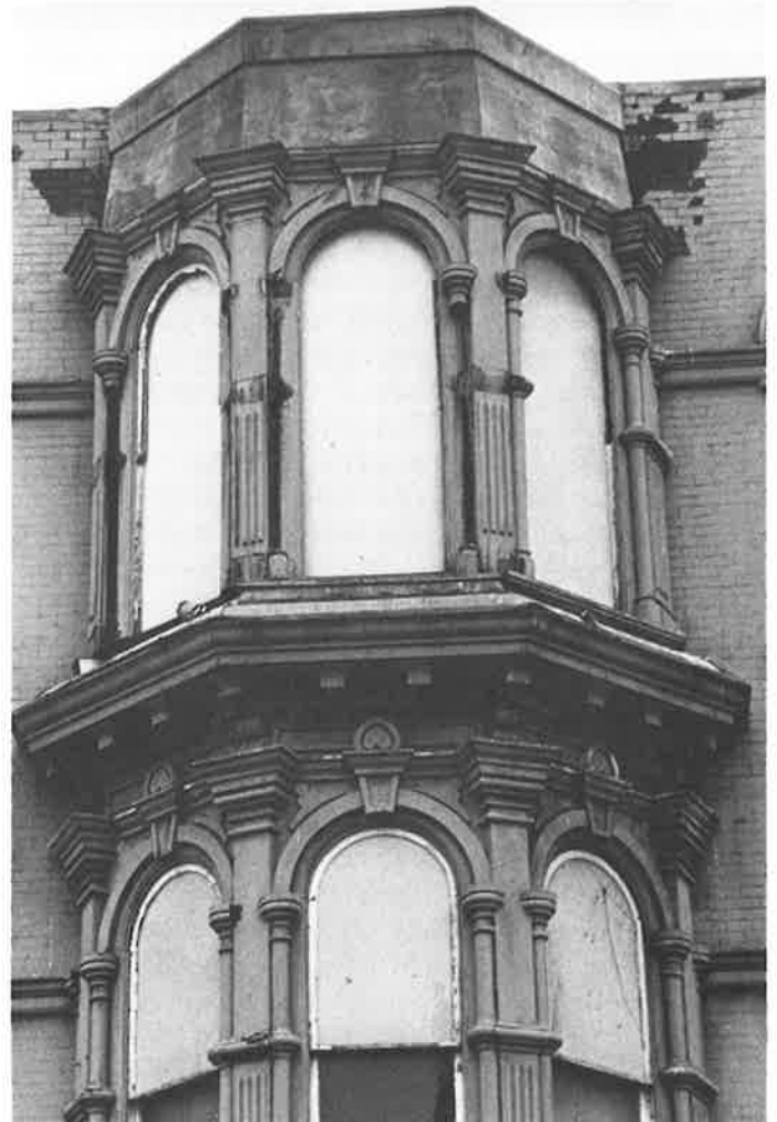
Ratto's, center bay on Washington as it appears today without cornice and cupola.

Board answered Oak Center residents' questions pertaining to proposed boundaries of the district, effect on property values, control over future development, National Register eligibility, and other possible advantages or disadvantages of district designation. Eleven of about 18 present voted to support the designation; none voted to oppose. Postponed action until a questionnaire could be mailed to