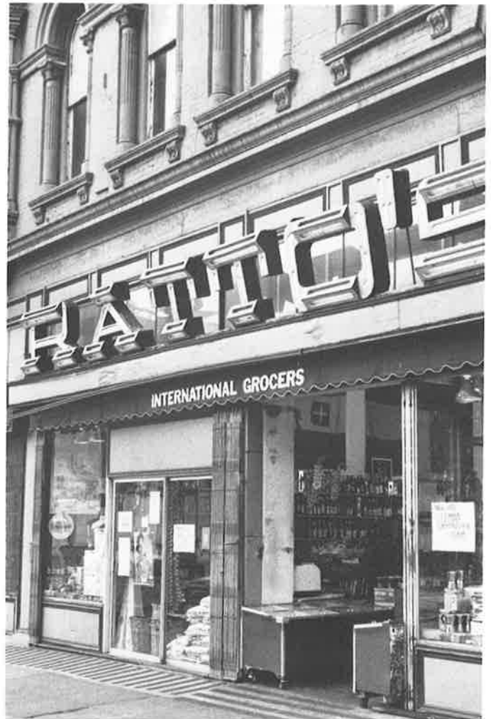
Ratto's: alterations approved for storefronts and familiar sign.