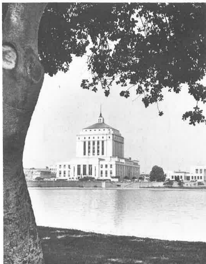
Alameda County Courthouse from east shore of Lake Merritt, c. 1960

From 1934 to 1943, a succession of Depression-era federal art programs provided murals and sculptures to adorn existing and new public buildings. One of the latter, the Alameda County Courthouse was a $2 million project supported in part by the PWA and the rest by a bond issue voted in 1934 on grounds "that the project would 'put men to work' and that consolidating