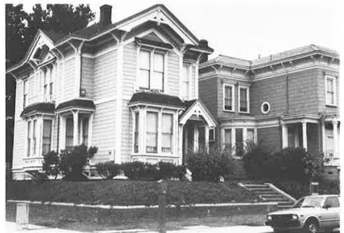
Oak Center neighborhood: no incentive to accept historic district status?