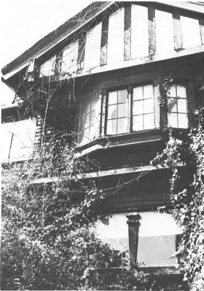
Julia Morgan's McElroy house, 401 Lee Street: Adams Point survey studies neighborhood's surviving historic houses, seeks your help.