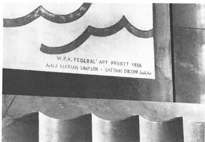
Opus sectile waves and fluted marble walls frame the artists' signatures.