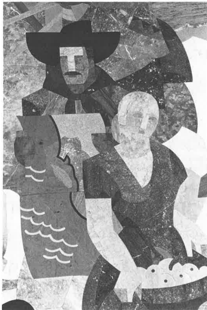
The wild west is mapped, and agriculture yields its fruits (detail, north panel)