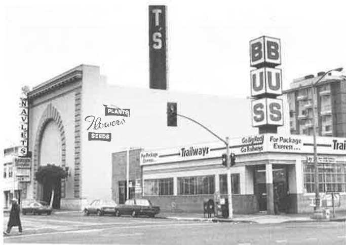
Uptown Oakland, 20th and Telegraph: part of the area being studied for $200 million retail center.