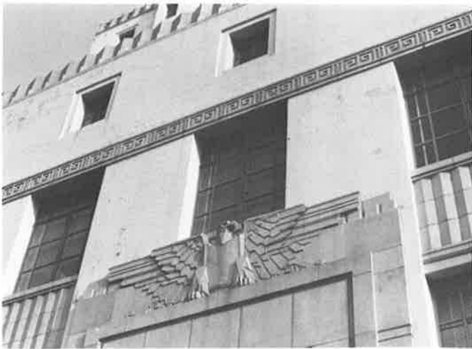
Courthouse detailing shows classical and Art Deco roots of WPA Moderne style.