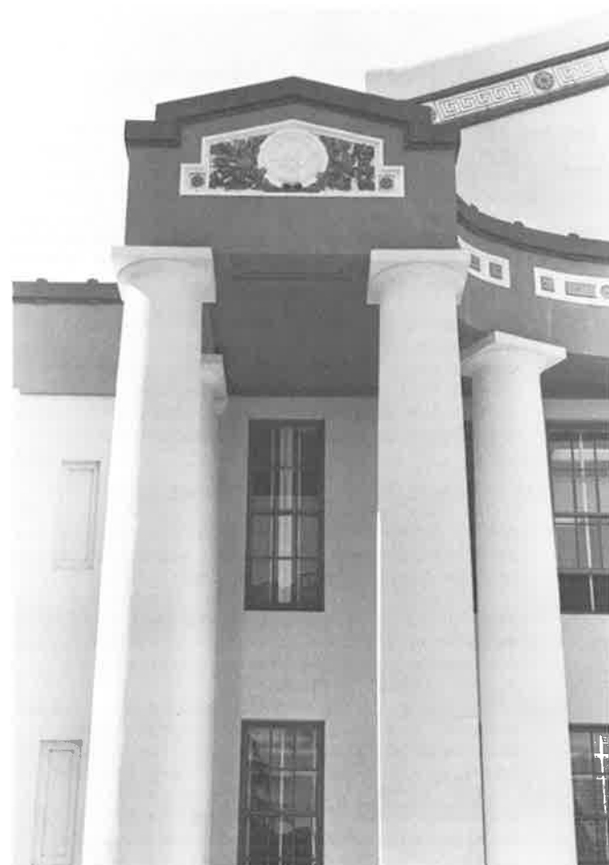
Oakland Technical High School, new city landmark