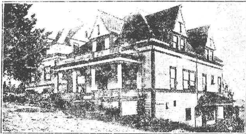
BUELAH, CALIFORNIA Established September 16, 1892

A business card pictures the Home with its 1905 Annex