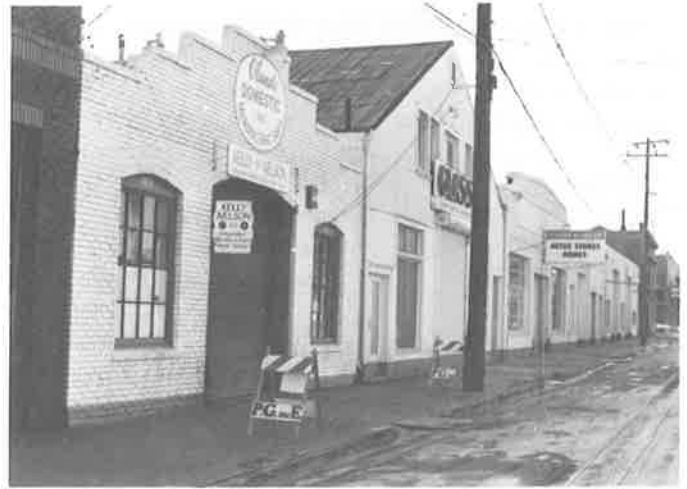
25th Street Garage District, included in the Central District Survey (Survey photo)

During that time, every building on 280 blocks in the Central District (to 27th Street) was given at least a preliminary evaluation by survey staff. More than 1100 properties were researched, evaluated, reviewed, and given a final ranking. Buildings, groups, and districts which appeared eligible for the National Register were recorded on State Historic Resources Inventory Forms. For the Central District, 165 State Forms were prepared with a written description, statement of