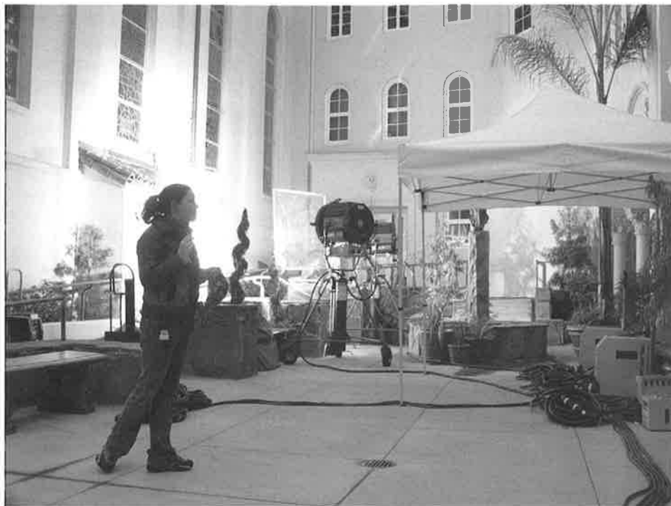
A BACK-LIT CREW MEMBER at the Bee Season shoot at Our Lady of Lourdes church.

The office works with production companies to secure locations and permits.