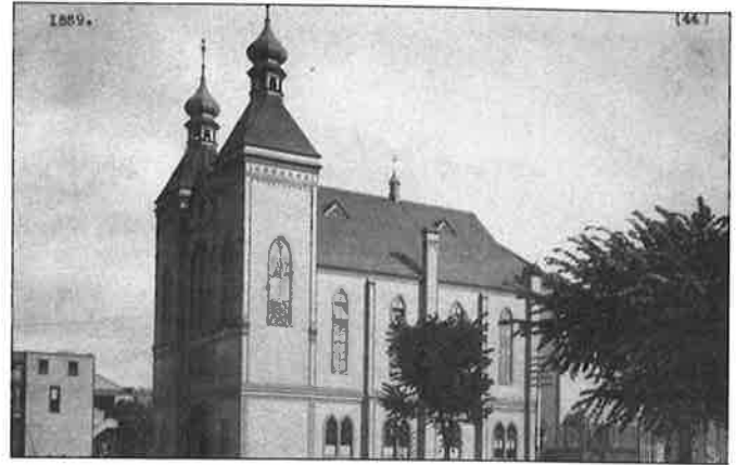
AN 1889 VIEW of the First Hebrew Congregation on Clay Street.