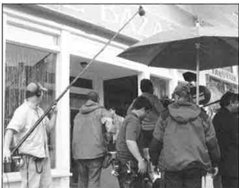
A CREW MEMBER holds the boom microphone over a light-sheltered scene for Mistress of Spices , left. Below, it takes many behind-the-scenes people to make Bee Season happen at Lake Merritt.