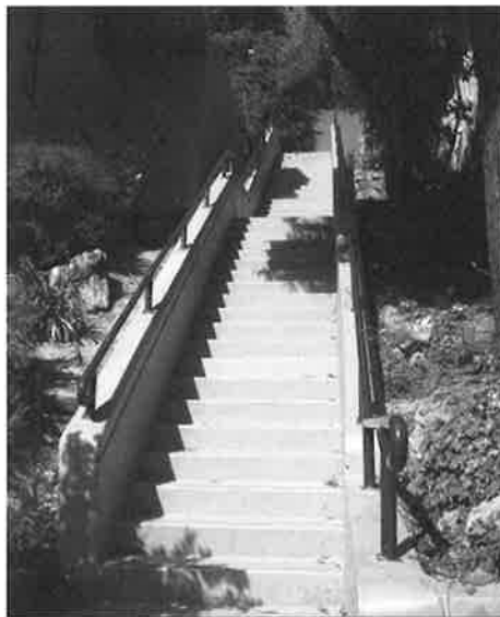
THE BRIDGEVIEW PATH , above, shot looking towards Leimert Boulevard in the Oakmore District, has been completely rebuilt. At right is the original Cleveland Cascades at Lake Merritt, currently being rehabbed by volunteers. This photograph originally appeared in the March 1931 issue of American Landscape Architect .