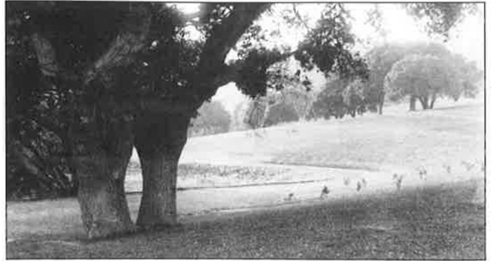
AN EARLY VIEW of the pastoral Trestle Glen. Not dated.