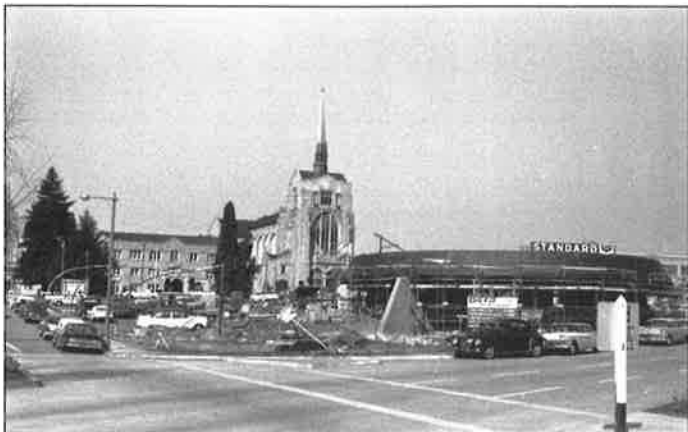
THEN CALLED BIFF'S , the "flying saucer" coffeeshop later known as JJ's is constructed on Broadway at 27th Street.