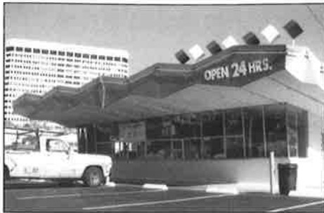
WHAT'S NOT TO LOVE about the funky Giant Burger at 21st and Telegraph?