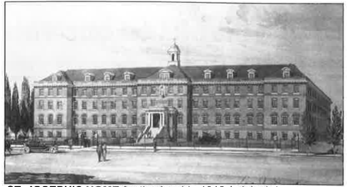
ST. JOSEPH'S HOME for the Aged in 1912 (original drawing).

By their 50th anniversary in 1957, the Little Sisters estimated that they had cared for,