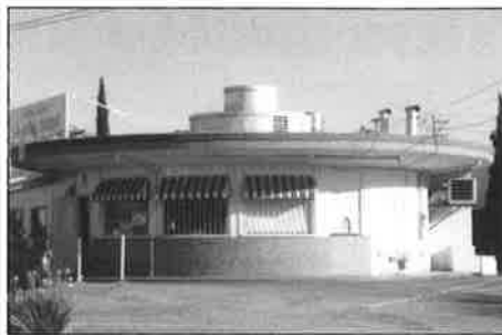
THE LIKEABLE ROUNDNESS of Googie: at top left is the Asian restaurant at 8th and E. 12th; at top right is the hair salon at 17th and San Pablo.