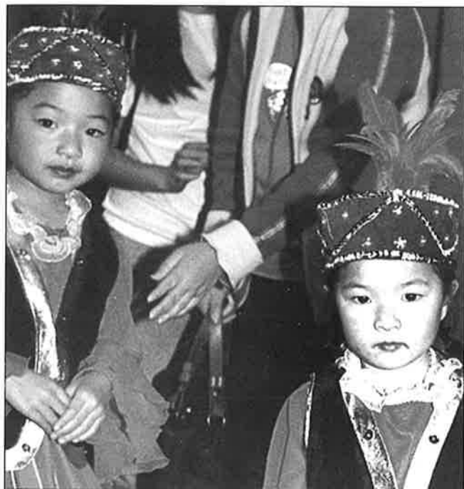
Girls from the Chinese Folk Dance Association wait backstage in elaborate costumes.