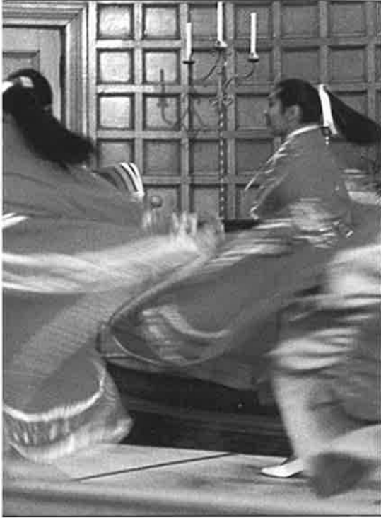
These Sol Mejica dancers.