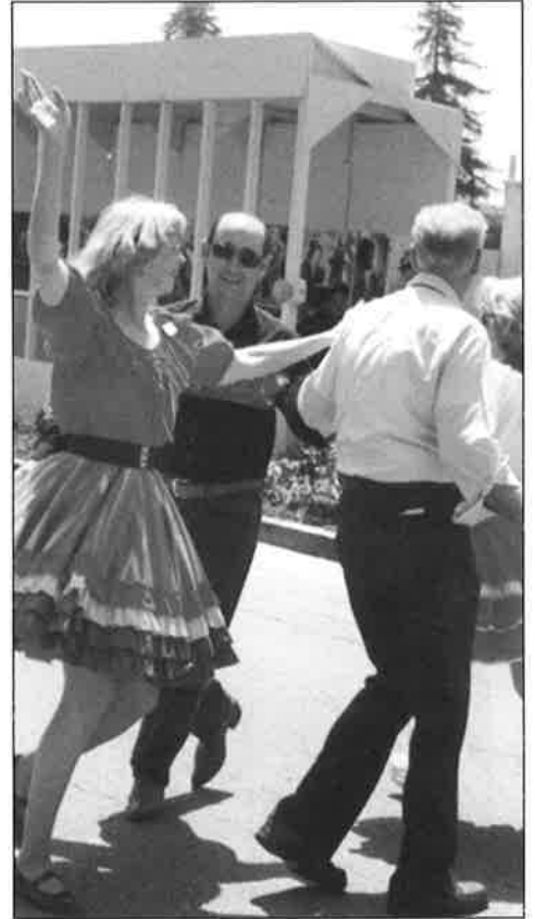
Square dancers swing their partners on closed-off 12th Street.