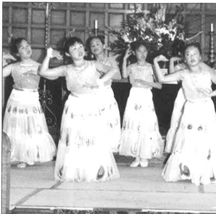
In gossamer dresses, the Chinese folk dancers adopt stylized poses.