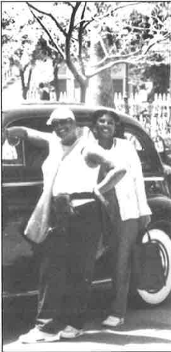
Two modern-day ladies pause by one of the antique cars in Preservation Park. The park was dressed in its finest for the day: costumes, cars and the homes combined to celebrate Oakland's birthday.