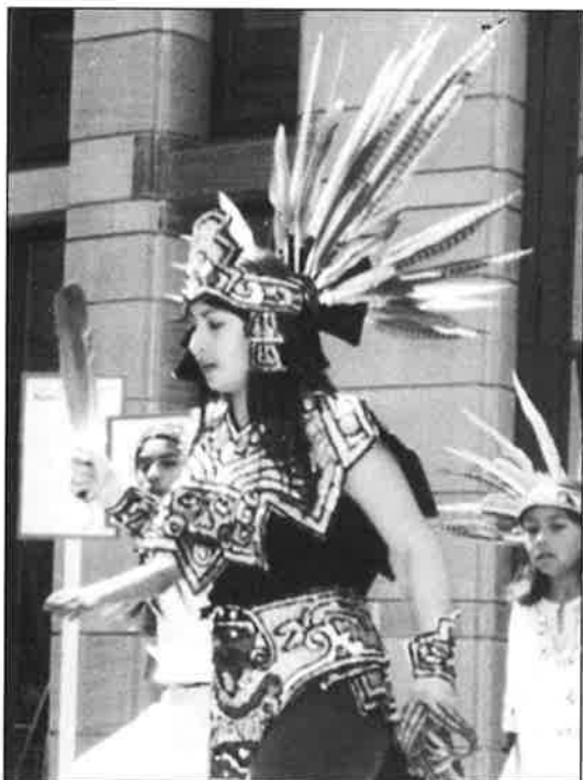
An Aztec dancer concentrates on her moves.