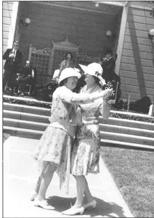
At Preservation Park, visitors found the strains of the Royal Society jazz orchestra irresistible and simply had to dance.