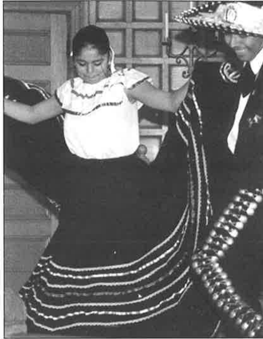
The love of the dance is apparent on the faces of these two young dancers from Sol Mejica, who performed in the church.