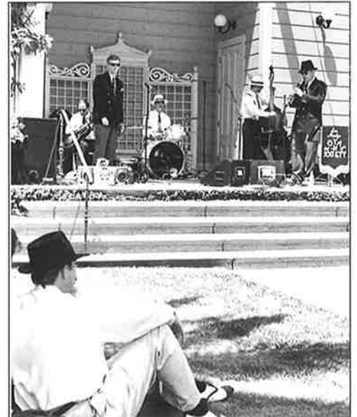
For others, mellowing out on a picnic blanket was the way to go.