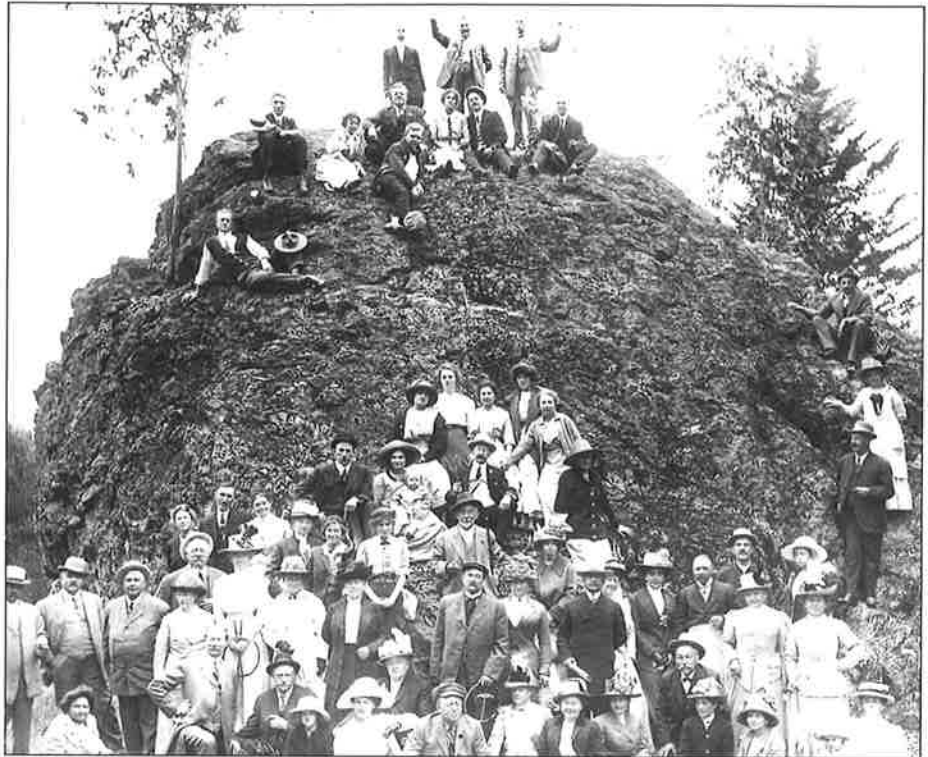
Oakland History Room