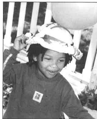
The Museum of Children's Art (MOCHA) contributed to the day's festivities, helping youngsters to make their own hats. Left, there's a kid underneath that newspaper, being wrapped with masking tape by a MOCHA helper; above, enjoying the product of all that labor.