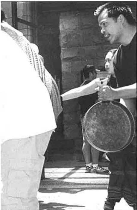
Two instruments in a workshop on the plaza is Filipino music and led the audience,