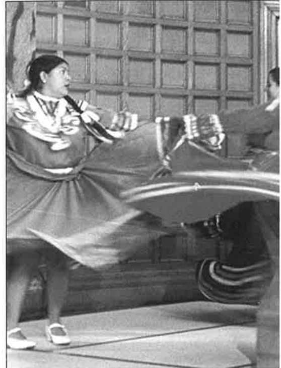
Skirts are a blur, in the energetic spurt of motion f