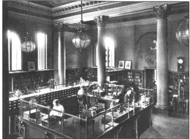
Oakland History Room

This beautiful building is now beginning its second century in a whole new role.