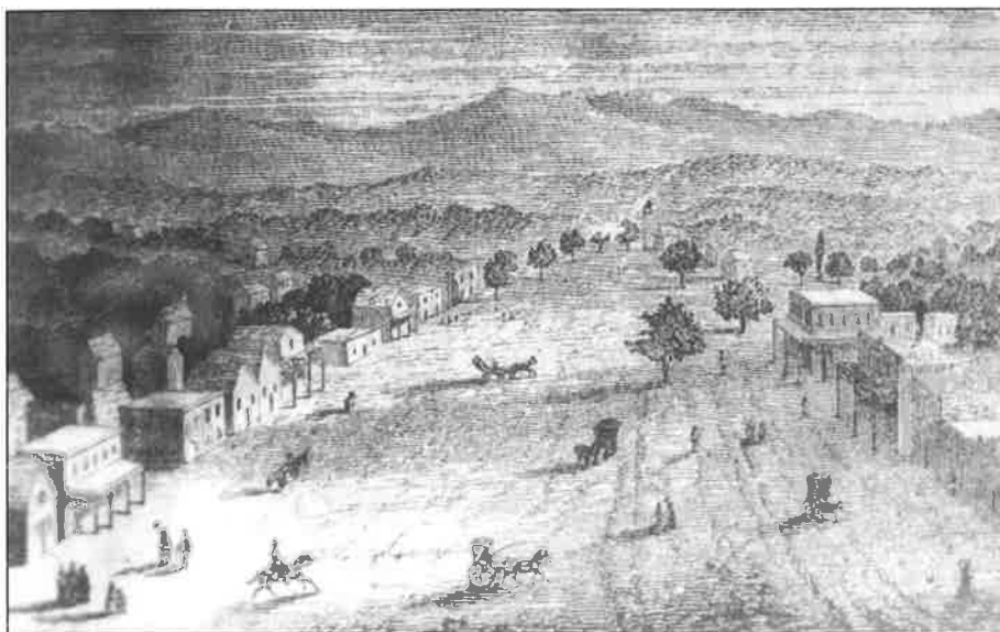
Oakland History Room

Volunteers are needed to help with tours, mailing, press calls, flyer distribution, decorating, set up, and clean up. In addition, if you or someone you know is