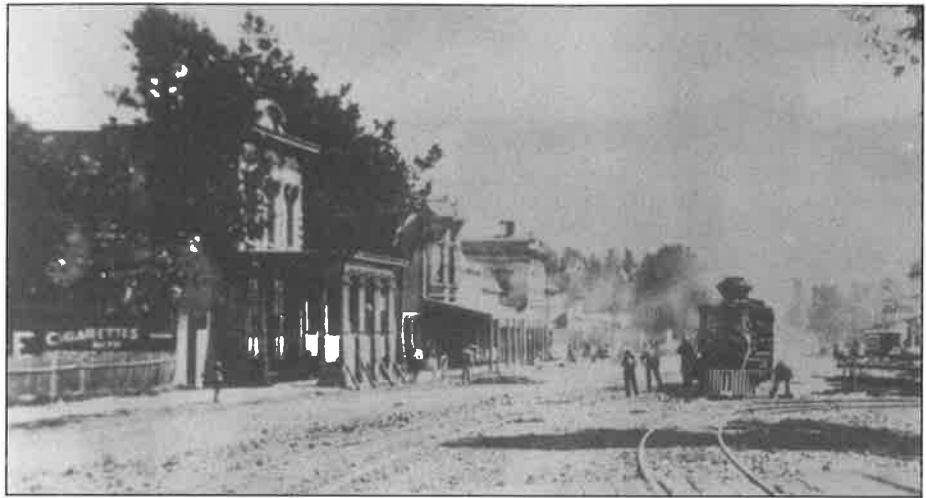
Oakland History Room

By the time Temescal got its post office, three tracts had been filed at the county courthouse: Oakland Rail Road Homestead (1869), Temescal Park (1873), and Vernon Park (c.1872).