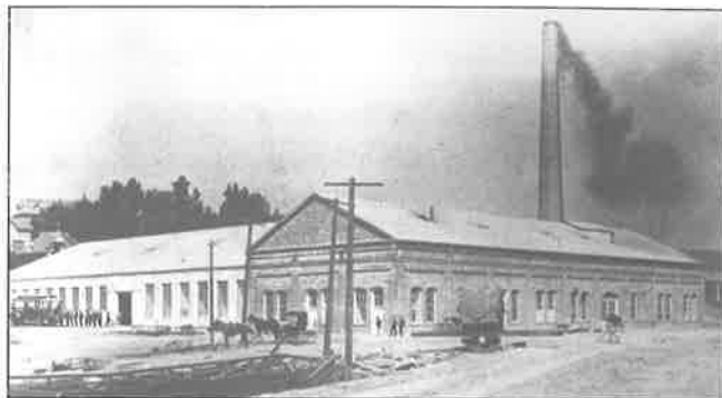
Oakland History Room