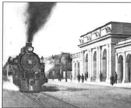
Oakland History Room

— Anthony Hutchinson Oakland Western Pacific train station on 3rd Street