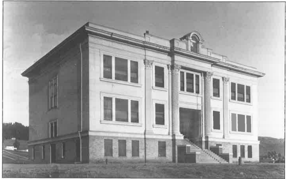
Oakland History Room