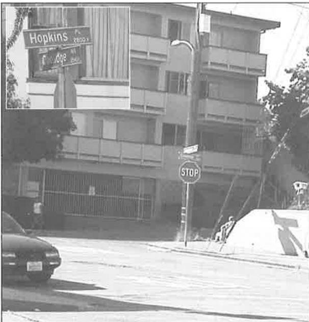
Tiny Hopkins Place, just off MacArthur Boulevard, is all that remains of Hopkins Street, once a lengthy thoroughfare that stretched from the Dimond District to Mills College.