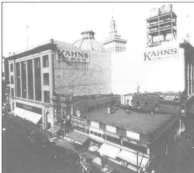
Oakland History Room