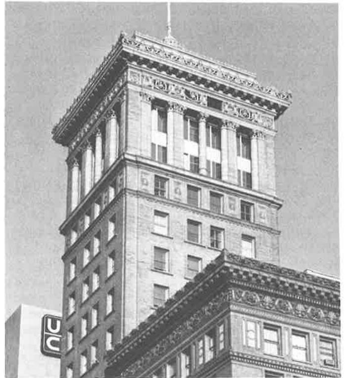
The Bank of America Tower, shown here in 1978, has since had terra cotta ornament removed because of its immediate danger of falling off. Now in storage are elaborate grills forming part of the frieze in front of the top floor windows and decorative cresting running across the top of the parapet.

The Lurie Company, owner of the BANK OF AMERICA TOWER (originally Oakland Bank of Savings) at 1212 Broadway is conducting an