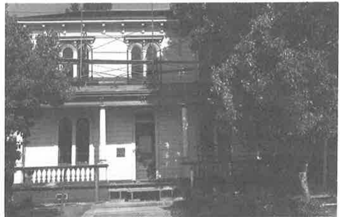
Peralta House, 1982, during restoration