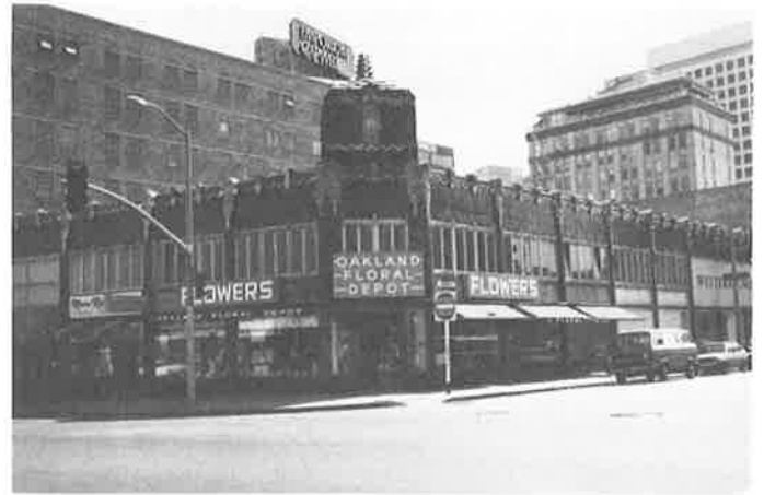
Oakland Floral Depot Building, 1982