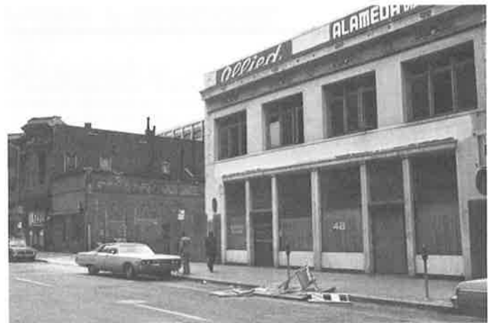
Proposed Victorian Row demolitions at 469 and 485 10th Street

Because the two buildings are included in the city's S-7 Preservation Zone,