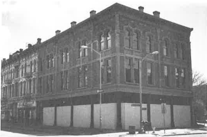
The Snyder Block, also known as the La Salle Hotel, is one of the latest Oakland city landmarks.

ferred action on the Study List additions until after completion of a state form list being prepared by staff.