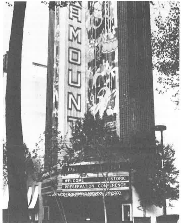
Paramount marquee welcomed conference