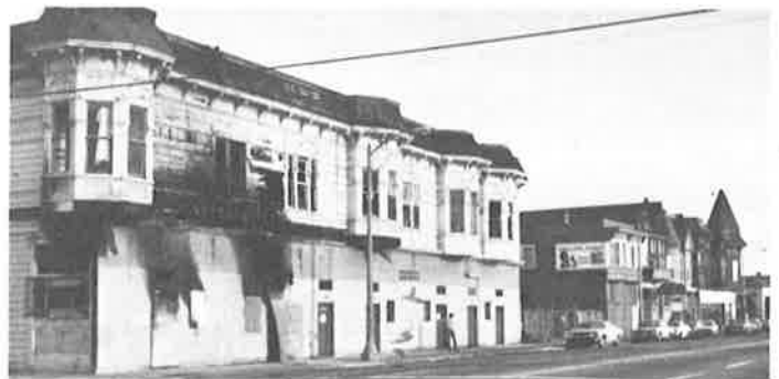
Hinson Building (left) and China Building

The five Victorian and early 1900's two- Continued on page 6