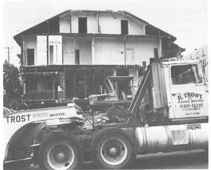
Metcalf House about to be moved