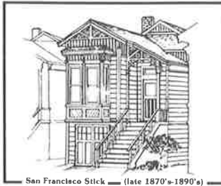
San Francisco Stick (late 1870's-1890's)