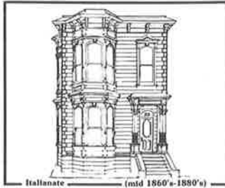
Italianate (mid 1860's-1880's)