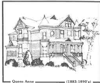
Queen Anne (1883-1890's)