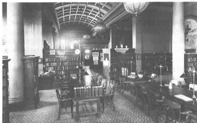
The Charles Greene Library, c. 1902.

Finally, in 1899, the new City Librarian, Charles S. Greene, approached steel magnate Andrew Carnegie (who had lately embarked upon the endowment of library buildings) for a new Oakland library. The feisty tycoon agreed to Mr. Greene's request—provided that Oakland supply the land. Numerous sites were proposed for the Carnegie Library—among them Lincoln Park, Lafayette Park, City Hall Plaza—but funds were scarce to buy land. Fortunately, the Ebell Society (Oakland's venerable, civicly active women's society) launched a vigorous and highly publicized subscription drive, securing $20,000 for a vacant lot on the corner of 14th and Grove Streets, next to the First Unitarian Church. The architects selected were Bliss and Faville (best known in Oakland