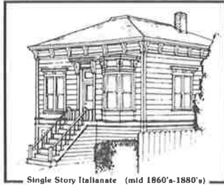
Single Story Italianate (mid 1860's-1880's)