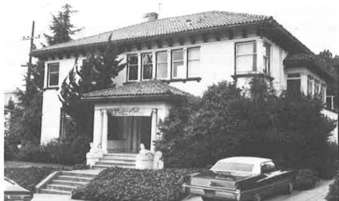
Victor H. Metcalf House-245 Perkins Street.

● On September 30, Alameda Superior Court