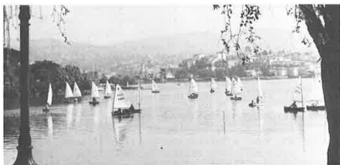
East shore of Lake Merritt (c.1969) included in the height-limitation study area. The tallest building in the photo generally do not exceed 5 stories. Under the current zoning, buildings as tall as 12 stories have been proposed. A row of 12 story buildings at lakeside would block views of most of the ridge in the foreground.

● In early 1981, public protests against the proposed construction of a twelve-story apartment building at 2340 Lakeshore Avenue facing LAKE MERRITT prompted the City Council to request a study of more