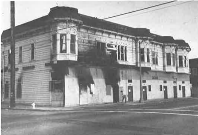
Fire damaged Hinson Building on 12th Street.

● On November 12, a four-alarm fire seriously damaged the CENTRAL BLOCK (now called the "Hinson Building"), a two-story wood-frame Victorian commercial structure located at the northeast corner of East 12th Street and 11th Avenue. The structure was built in 1879-80 by Charles Jurgens, a