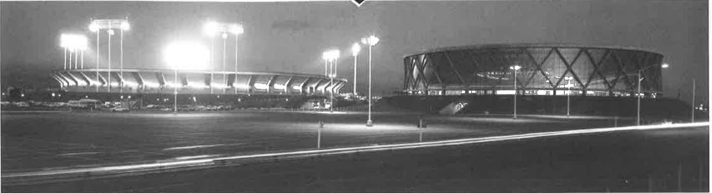
Coliseum's "irresistible structural art" in 1969