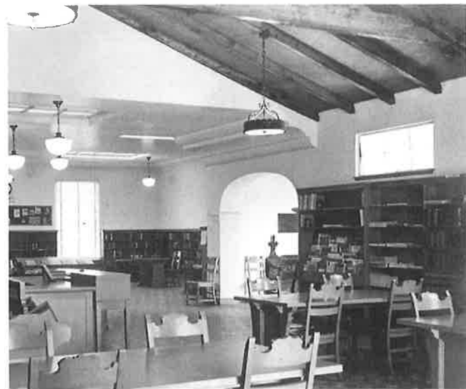
Though no longer used as a library, the Glenview Branch retains many interior features of Archie and Noble Newsom's 1935 Spanish-style design: tile floor, decorative beamed ceiling, built-in shelves. Board discussed protection if building is sold. (OHR)

Board discussed plans for Adams Point rezoning, including a proposed lakefront