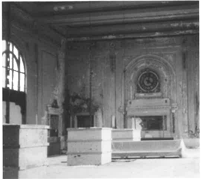
Southern Pacific station is approaching picturesque ruin status, if stabilization is not undertaken soon. You can help by writing to Metropolitan Transportation Commission in support of grant.