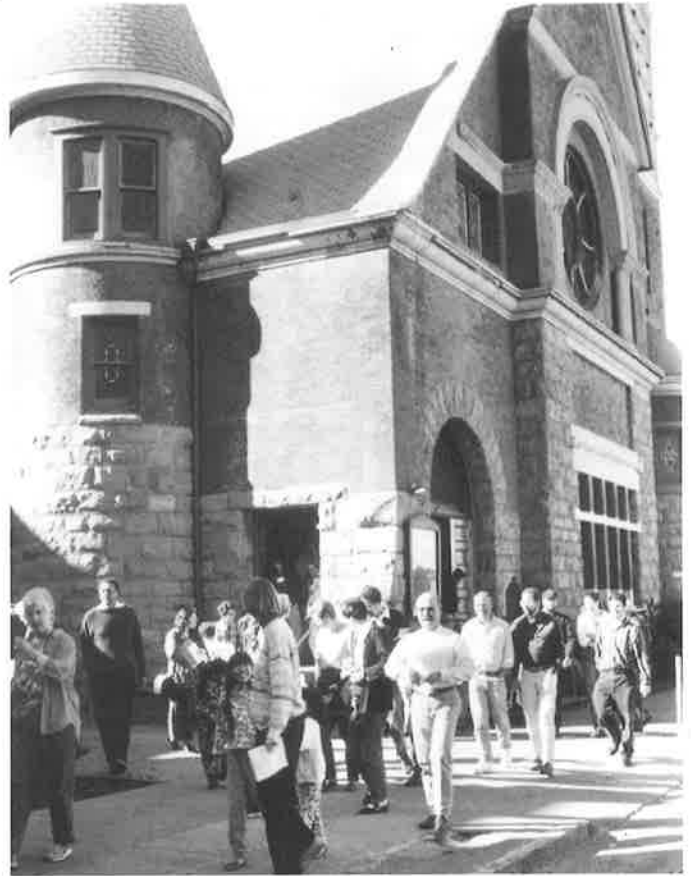
Parishioners and friends walk from First Unitarian to First Baptist Church, celebrating the start of renovation work.