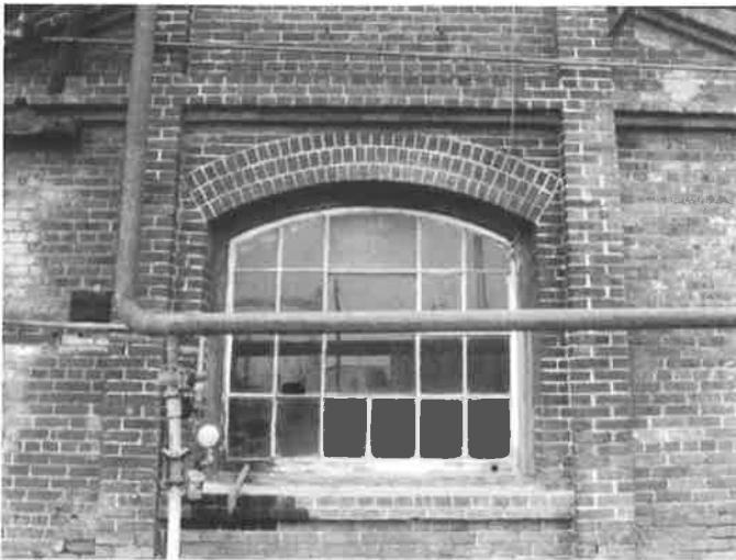
Southern Pacific Yards and Shops buildings, built between 1874 and 1914 and of supreme historical importance to Oakland and the west, will apparently be demolished since proposal to move them to Rio Vista Junction fell through for lack of time and funds. Caltrans told the railroad story in "Crossroads" video, and is also recording the buildings in HABS and other formats.