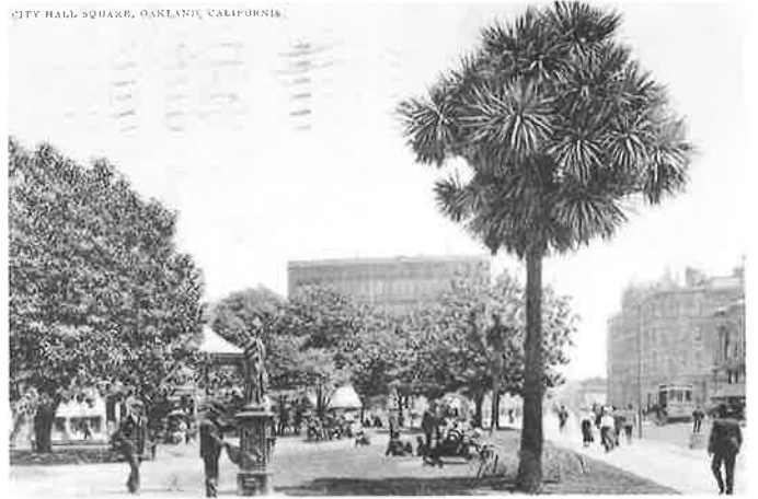
City Hall Plaza, now Frank Ogawa Plaza, has been renamed and redesigned many times. This postcard, mailed in 1910, shows a sculptured fountain, rustic bandstand or gazebo, palms, and a cannon captured in the Spanish-American War. The view is east along 14th Street from Washington: the curved building at right is the Macdonough Theater, on the present site of the Smith's building at 14th and Broadway.

S-7 (historic) district, whose boundaries would be determined by the Board.