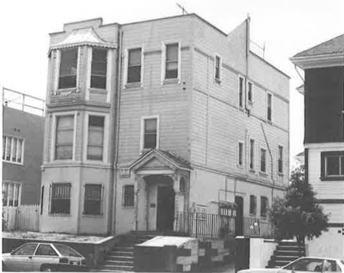
Some highly creative apartment conversions housed Oakland's war workers. This West Oakland house is a Queen Anne cottage, greatly enlarged in 1944, with wood trim, porch, and other parts recycled. (Survey)

itself in various ways. Many white residents of West Oakland moved out to all-white neighborhoods or suburbs. By the end of the war, in contrast to the pre-war boast that "West Oakland was everybody," Oakland had become a segregated city.