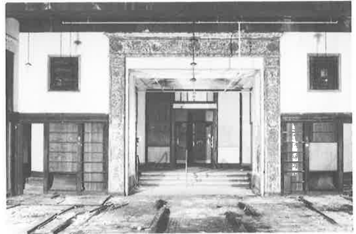
Years of leaking roofs nearly destroyed the library at Old Merritt, adding to costs for developers who now seek to restore the building.