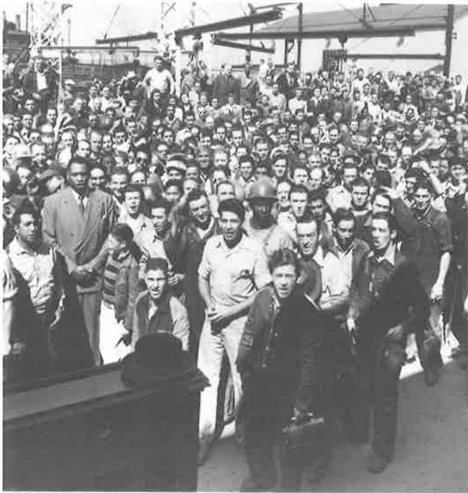
Paul Robeson leads Moore shipyard workers in the National Anthem, September 20, 1942.

shortage developed in the Bay Area. Kaiser and other California industrialists sent labor recruiters outside the state, especially to the South, where workers and their families, both black and white, boarded trains and buses for California.