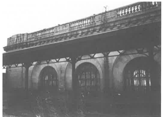
Inspectors climbed from the weed-grown Interurban platform behind the 16th Street Station and found the major source of damage to be clogged gutters. City is trying to bring about repairs.