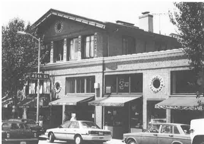
Intact period storefronts of this unique Julia Morgan commercial building will survive, thanks to vigilance and expertise of PANIL, Board, and staff.