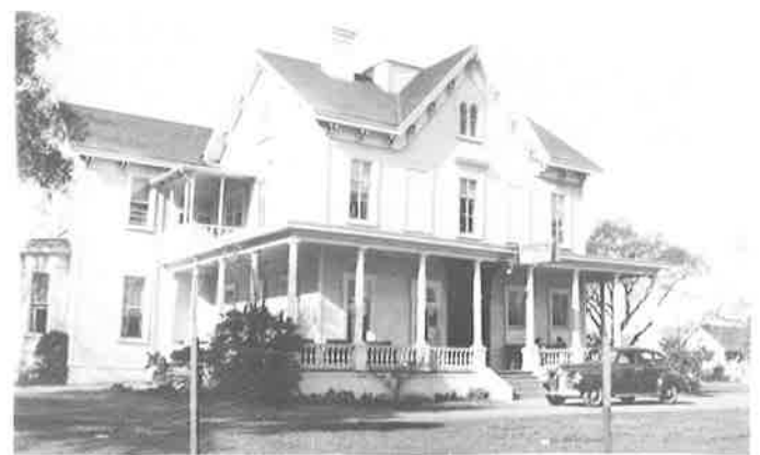
The DeFremery House in West Oakland, built as a suburban estate in the 1860s, has been part of the city park system since 1906. This wartime photo shows it as the USO club.

Oakland's African-American women contributed to the home front war effort in other ways. They served on the Hospitality Recreation Committee, a local chapter of the Defense Council. Club women attended defense classes, joined sewing units, taught first aid for the Red Cross, and visited and entertained troops as volunteers for the USO. Linden Branch YWCA members entertained the troops at the all-black DeFremery USO club house.