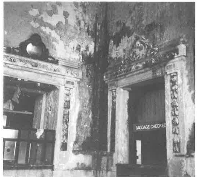
Ornate interior of the S.P. Station has been heavily damaged by five years of water from clogged gutters. Contractors show scant interest in bidding for work to protect remaining interior features. (Betty Marvin)

Of the bids received, one covered the full scope of work while the second only included repair of the cracks in the exterior walls. The bids have been forwarded to Southern Pacific with a request for timely action to prevent further deterioration. This is part of the City's effort to bring Southern Pacific into compliance with the local ordinance that protects earthquake damaged landmarks from damage caused by vandalism or the elements. --Carolyn Douthat