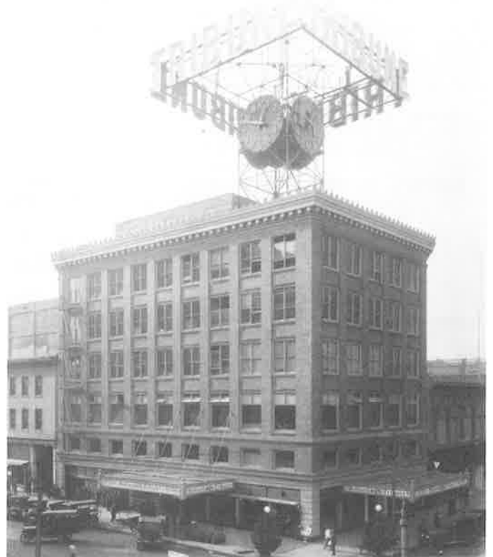
The Tribune sign predates the tower! Electric sign and clock floated over the corner building before the tower was added in 1922.

July meeting was held July 31; there was no August meeting. --Kathy Olson