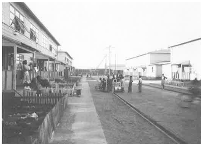
Bay View Villa, on filled land near the 16th Street Station, was one of the temporary housing projects. The site is now industrial.

Oakland's 1940 black population of 8,462 was less than 3% of the total population of 302,162. By 1950 the black population had more than quintupled to 47,562. In Oakland and other West Coast cities with large numbers of new black residents - Los Angeles, Portland, San Francisco, and Seattle - contemporaries noted an increase in racial prejudice during and after the war. White backlash in Oakland manifested