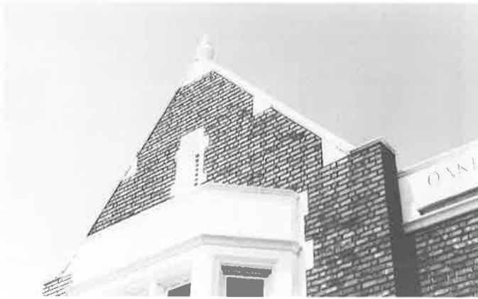
Dickey & Donovan's Temescal branch is the only Tudor Revival Carnegie Library in California. (Survey)

"neutral" on the issue of landmarking the interiors, have pledged to plan the work in a manner sensitive to the National Register-eligible interiors and exteriors. It remains to convince City officials to commit to the next step: an estimated $2 million per building for the actual work.