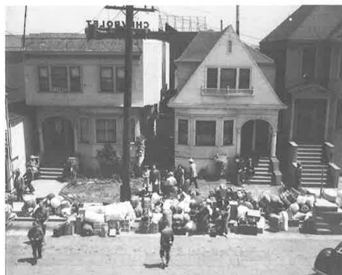
Oakland and San Leandro residents report to the Control Station at 1117 Oak, and wait inside the bare cement garage building and on front steps and yards across the street. Footprints of neighboring buildings helped identify the Control Station site on Sanborn maps.