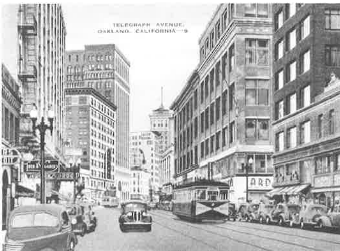
City administration building project--linking the Broadway and Rotunda buildings, right center--is hoped to revitalize downtown Oakland; Preservation Element actions have the same aim. This c.1940 postcard is captioned "Skyscrapers make a canyon of commerce of Telegraph Avenue."

As reported in the last issue, mitigations approved in connection with the city administration building complex would seem to create an opportunity to fast track some of the Element's actions, specifi-