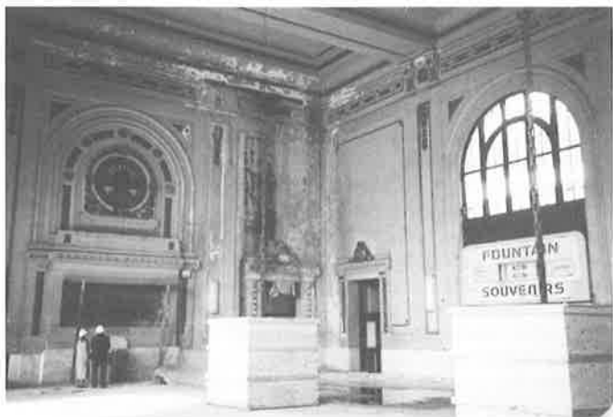
War workers poured into Oakland's 16th Street Station "like a parade." This important historic site is now sadly neglected and deteriorating: with the murals peeling, chandeliers taken down and crated, and water standing on the floor, it is hard to picture the excitement of 50 years ago. (Betty Marvin)

Less than a year after the U.S. entered the war, a report estimated that 10,000 black troops were quartered in the East Bay. To provide recreation for these men, the DeFremery House, then used as a West Oakland recreation center, was converted into a USO club. As a USO club it had a canteen, lounge, and ballroom on the first floor, plus offices, a library, a game room, and a dormitory for 35 to 40 men. The USO provided staff to operate the club, and the Linden Branch YWCA and local women's clubs provided entertainment.