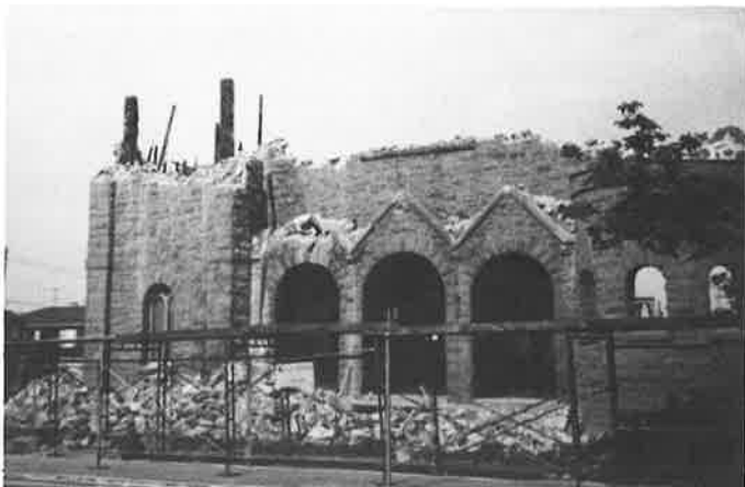
Friends of Sacred Heart fought for three years, but it took just a week to clear the site of the 92-year-old church. Friends still need help with legal expenses.