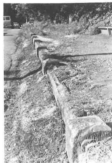
Hays's Fernwood "ranch de luxe" was one of Alameda County's showplaces in Thompson and West's 1878 atlas. The stone curb at left is its only visible trace today (OHR; Phil Bellman)

them the next day. Where was Hays during the hanging? "Away down the peninsula at a bull fight." Was he deliberately called away? To this day no one can be certain.