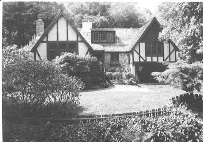
The Carr Jones castle (left), and one of Fernwood's Tudor Revival homes. House tour on May 16 features nine homes and five gardens in this remarkable neighborhood.