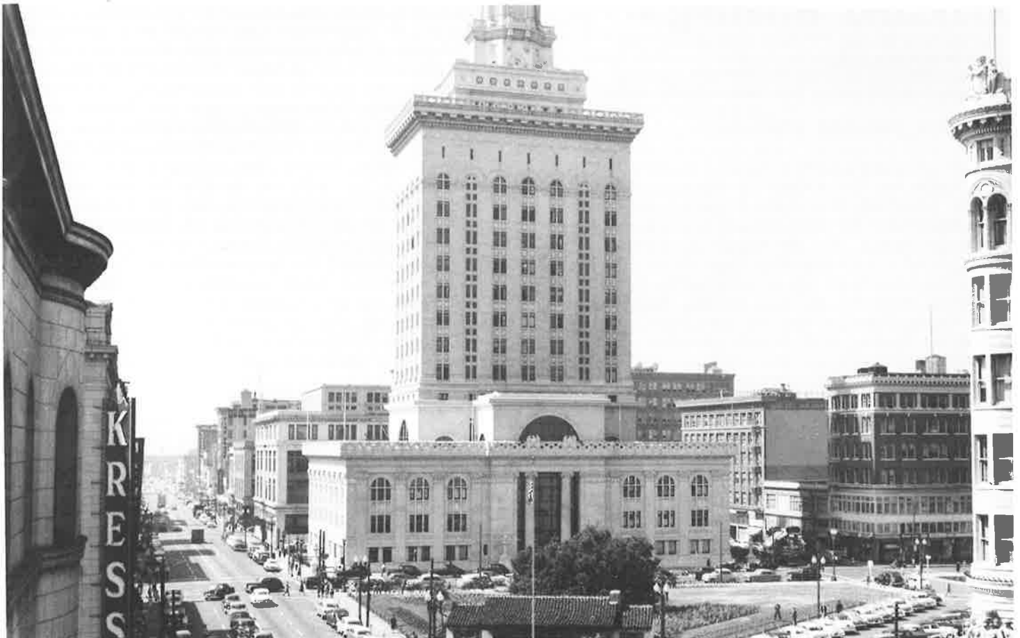
This mid-1950s view shows almost all the buildings on the administration expansion site: City Hall West (before remodeling) behind and left of City Hall, the George P. Miller building far behind to the right, and the Dalziel, Pardee, Plaza, and Broadway Buildings.