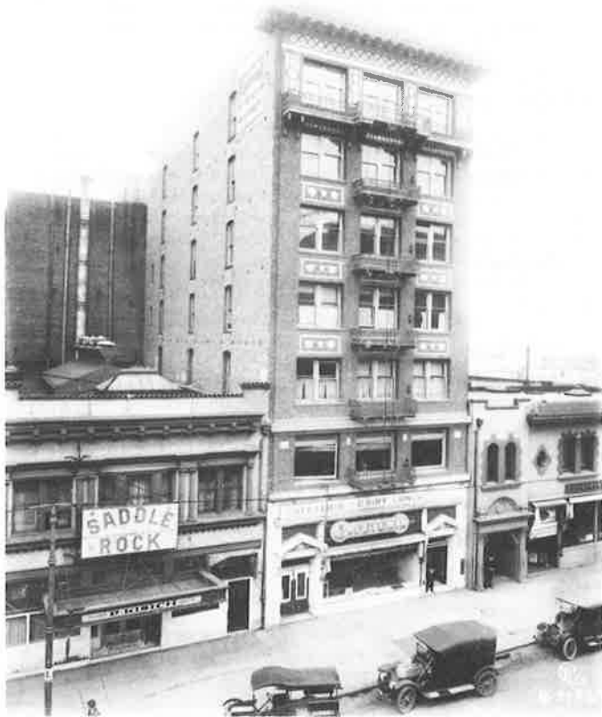
(Oakland History Room)

Prince among the aristocrats of Oakland's fine restaurants from the past was the Saddle Rock Cafe, situated on the north side of 13th Street between Broadway and Franklin, among the hubbub of the city's business and theatrical life. "One of the oldest cafes in the city is the Saddle Rock," the Oakland Enquirer informed its readers in 1909, "and it is