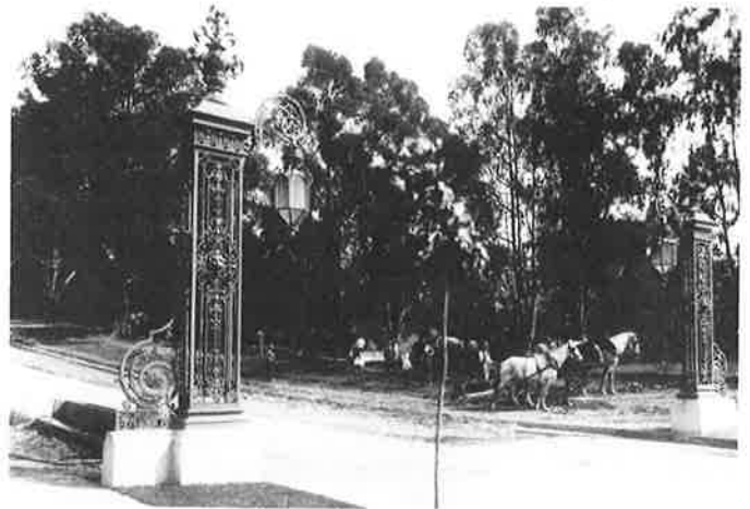
Horses were used for grading well into the 1920s. This is the foot of Longridge Road, with portals by Bakewell & Brown