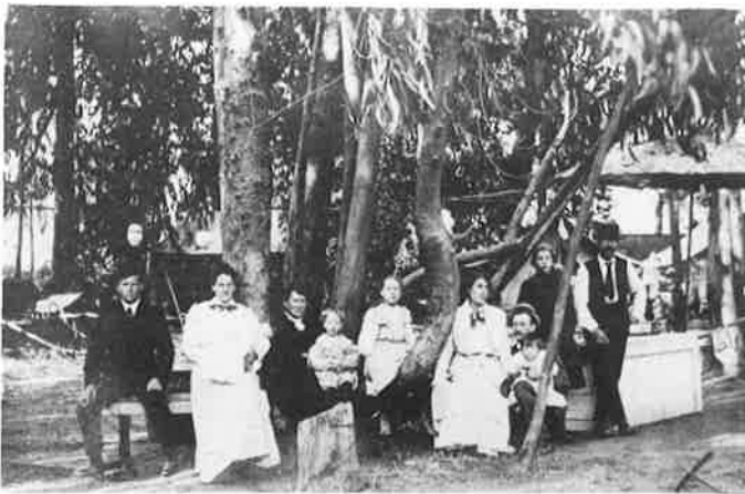
The trestle (above) crossed into the glen from about Holman Road and Grosvenor Place to Underhills. It lasted only a few years (1893-1906) but was a beloved part of the de facto park for urban Oaklanders, below.