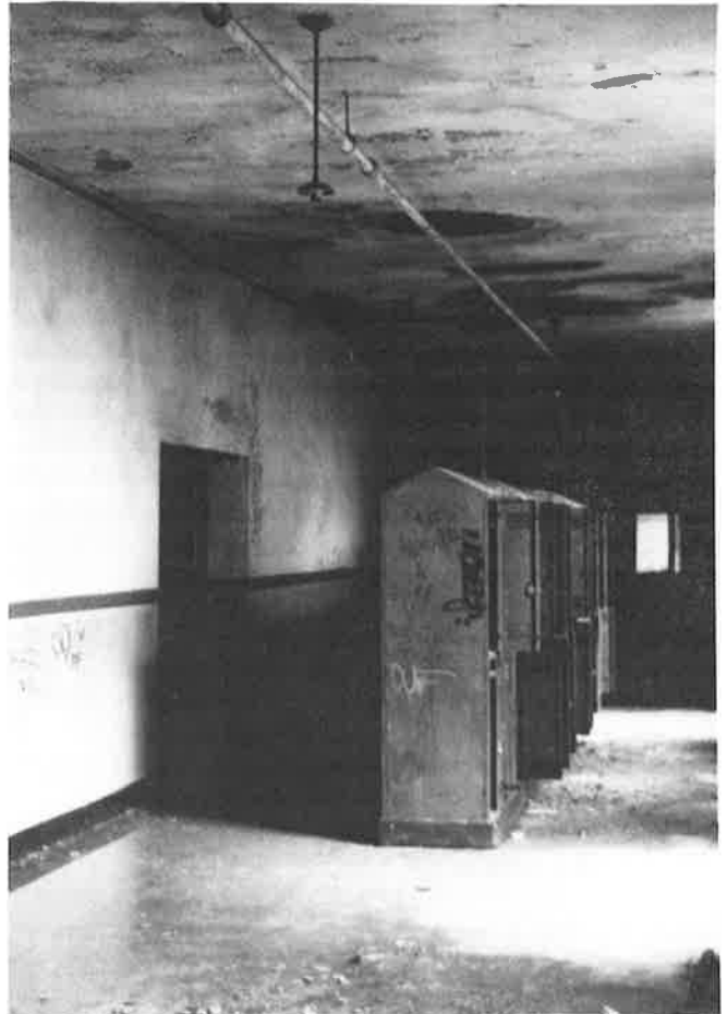
The hallowed halls of Old University High have been devastated by years of vandalism, water damage, and neglect.

While the City appears to feel it is saddled with an expensive white elephant, proposals are coming in from developers and other interested parties, despite severe