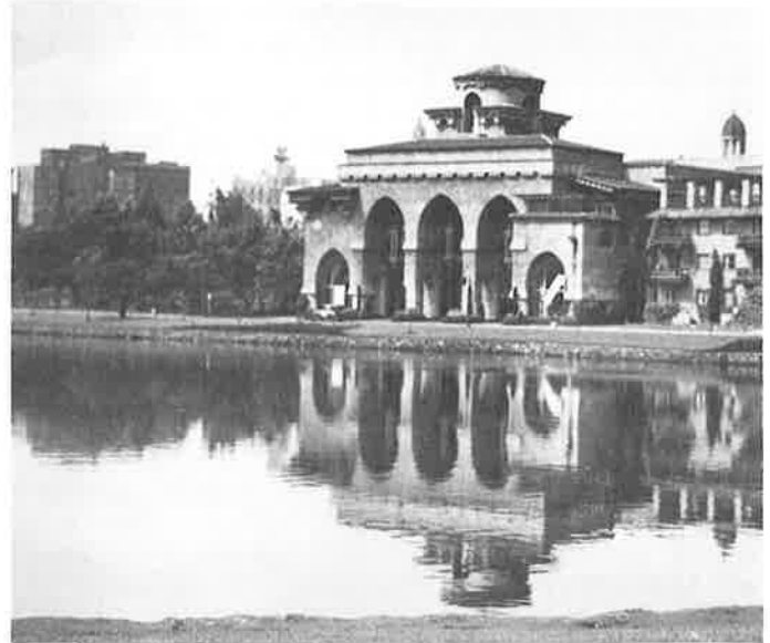
Demolition of Maybeck's Packard showroom (1929-1973) spurred landmarks legislation in Oakland.

Over the years there have been controversies over landmark designation and the lack of clear policy has resulted in some nominations being tabled for long periods. Perhaps the oldest nomination in this limbo is that for the Floral Depot at 19th and Telegraph which has been on hold since 1982. Impetus for formation of the task force, however, came not from controversy over a landmark nomination but from a 1986 proposal to build a new Lake Merritt United Methodist Church on Lake Merritt on the site of the former Fourth Church of Christ, Scientist. Public