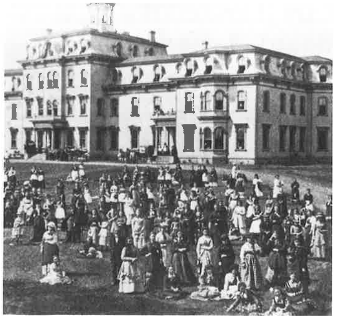
Mills Seminary students and staff c.1873, in front of Mills Hall, focus of current rehab effort.