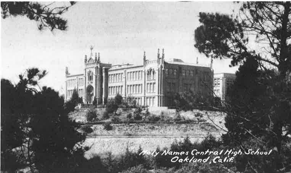
Holy Names High School, 4660 Harbord Drive, about 1935.

Oakland Heritage Alliance P.O. Box 12425 Oakland, California 94604