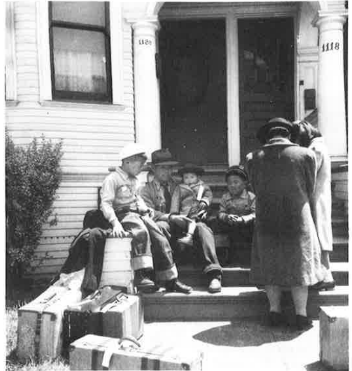
May 6, 1942: An Oakland family waits at 11th & Oak for bus to Tanforan Assembly Center, under Civilian Exclusion Order #28.