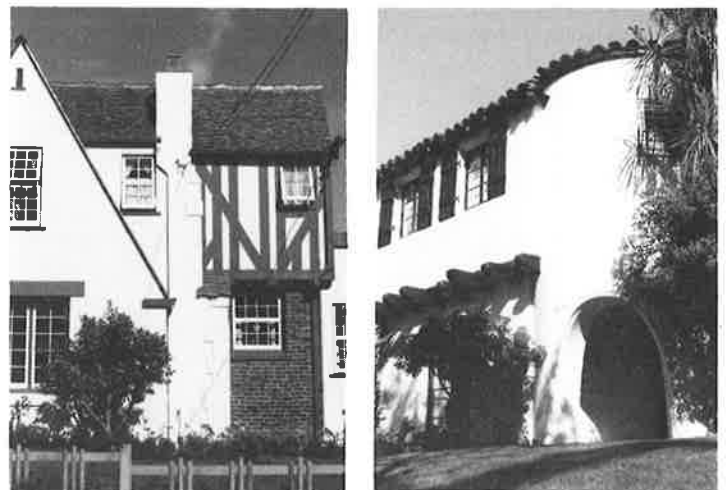
Period revival styling in the late '20s and '30s became more literal, detailed, and flamboyant, as these examples show. (BM)

Lakeshore Highlands developed during a boom period for residential building in