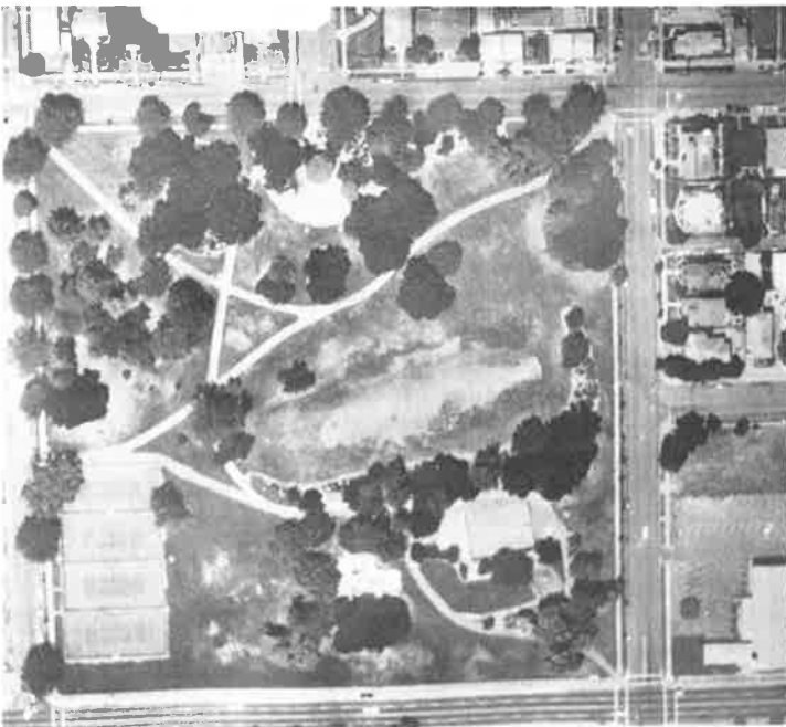
Aerial view of San Antonio Park before the recent additions shows bandstand at the crest of the hill, top center, along East 19th St.; Foothill Blvd. runs along the bottom of the picture.

And what of Sacred Heart? A preliminary City Planning Department "windshield" survey in 1985-86 rated the structure an A. An intensive, conclusive Cultural Heritage Survey evaluation and inventory form, how-