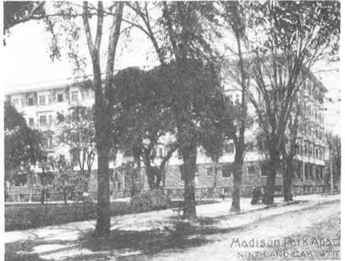
Postcard c.1910 shows Madison Park Apartments when it faced Madison Park--now site of BART headquarters.