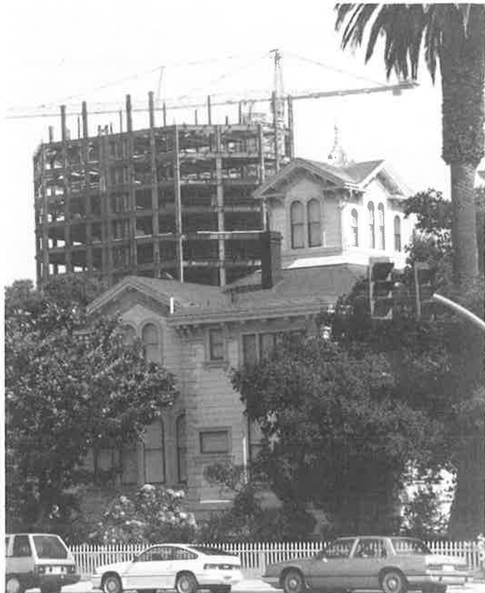
Progress in downtown Oakland: Pardee Home is now open for tours by appointment. (Phil Bellman)

Tours are by appointment only and are limited to 10 people per tour. Tickets are $4 general, $3 seniors. According to curator Heidi Casebolt, the archives are also available by appointment. The Pardee Home Museum is located at 672 11th Street. Call 444-2187 for reservations. --Helen Lore