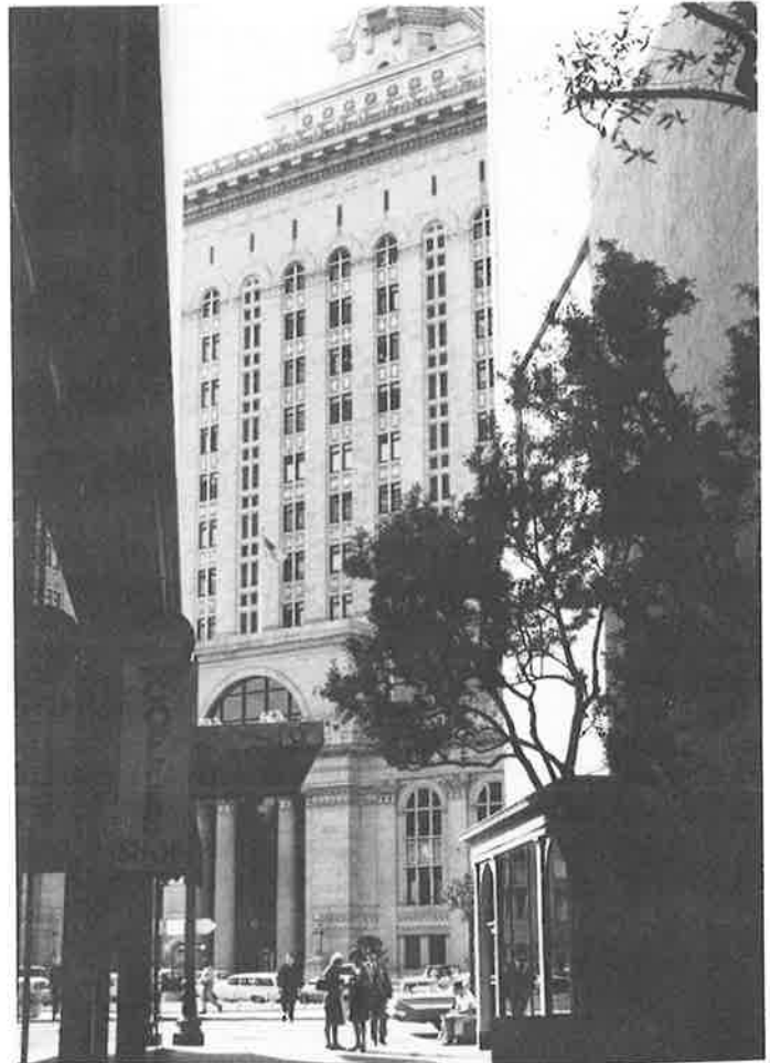
Civic and retail center: 1963 City Planning Department central district visual survey includes this shot through Kahn's Alley - between the Rotunda and the Broadway Building block - toward City Hall Plaza and City Hall.

According to the study, by 1995 the city will require a total of 371,000 square feet of office space, 80,000 of which will be available in the renovated City Hall. An additional 13,000 square feet can be provided in a proposed three story building on the site of the City Hall parking garage. The remaining 277,000 square feet would be located in the new office structure.