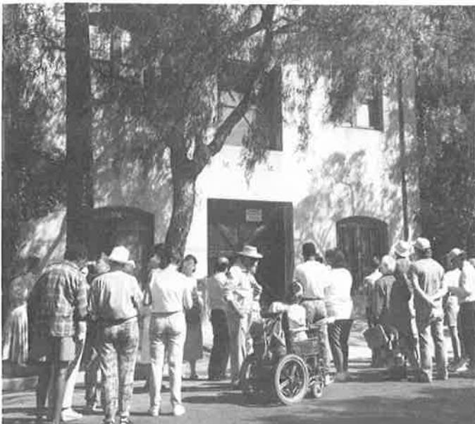
Summer walking tour group in South Prescott learns about the history of one of the West Oakland neighborhoods affected by the new freeway route.