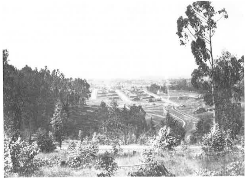
Upper Rockridge, c. 1910, looking toward Broadway and Rockridge Blvd.