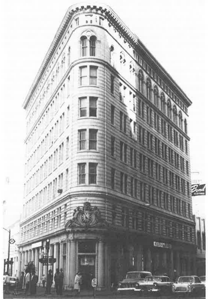
Broadway Building in 1963, when it was occupied by Wells Fargo Bank.

Even more positively, the Recht Hausrath study points out: "Selecting the Broadway/Taldan location also provides the opportunity for the City to retain and restore the historic Broadway Building on the site. Whether or not that would occur depends on City priorities for retaining buildings such as this one because of its merit and importance to downtown. The recently developed 'Vision for Downtown Oakland' identified the Broadway Building as a special place contributing to the character of downtown and recommended that it be retained if at all feasible (emphasis added) or replaced with another signature building that provides special treatment of this location... To achieve the local economic benefits available from City government use of this visible and prominent location, it will be important that renovated existing and/or new