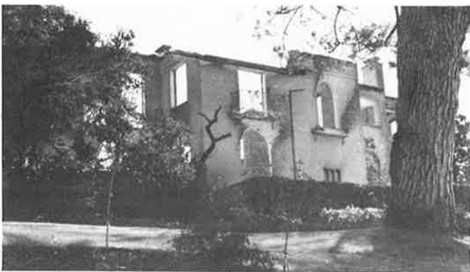
Red Gate a week after the fire.