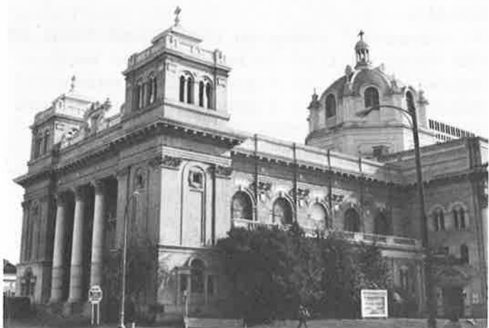
First Methodist Church, 2352 Broadway, built 1912

The FIRST METHODIST CHURCH is for sale and may be threatened. The building is listed with Ritchie and Ritchie for $2,000,000. Although attempts are being made to find a buyer who would reuse the building, the property may end up being sold for its land value, in which case the building would probably be demolished. The building is reported to need considerable rehabilitation work. The congregation applied for landmark designation in 1979, but recently withdrew the application. The Landmarks Preservation Advisory Board accepted the withdrawal, but kept the building on the Interim Study List, which would allow demolition to be delayed