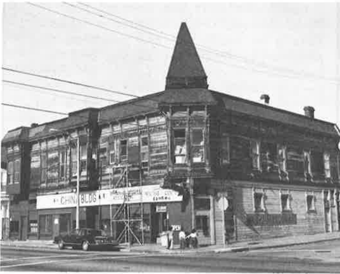
China Building, downtown Brooklyn

The Brooklyn Neighborhood Preservation Association requested that the OLD BROOKLYN COMMERCIAL CENTER (roughly bounded by East 8th Street, 11th Avenue, Foothill Boulevard, and 14th Avenue) be included in the City's S-7 Preservation Zone.