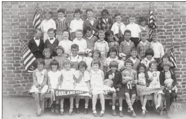
HAPPY THIRD GRADERS at Parker School in 1929.