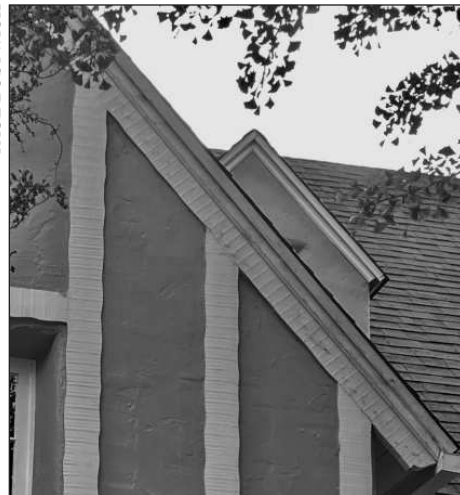
WAVY EDGES and a bandsawn face