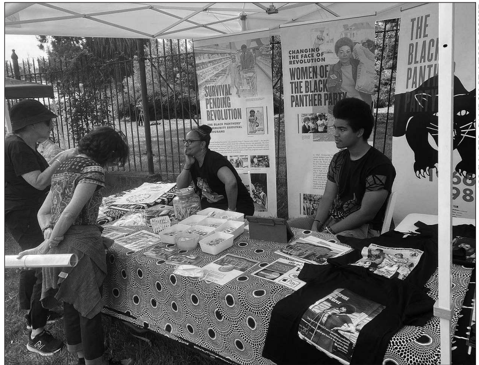
ALL IMAGES: CAMRON-STANFORD HOUSE

For those who wandered onto the terrace above, there was a big treat waiting, literally: a huge photo from a century ago with a view of the house from downtown. It must have been a wonderful neighborhood then, full of stately Victorian houses and an abundance of trees. ■