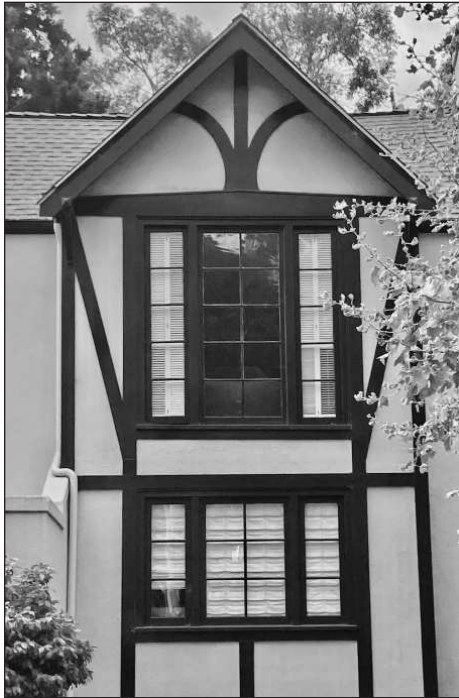
THIS HOME'S WOODWORK , alas, has lost its texturing.

But to come back to the “whodunit” of this tale: I have one more clue, also brought to us by rotting wood, as it happens. While replacing some siding in my garage, I happened to be there at the correct moment to see light come through a removed bit of rotten siding and graze across a wood post . . . one that had not seen direct sunlight in almost a century.