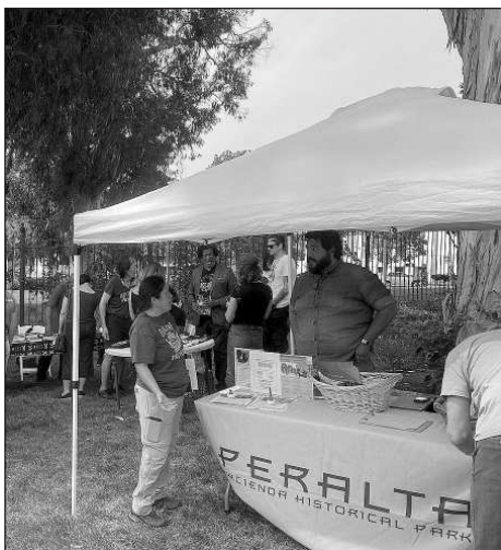
THE PERALTA HACIENDA Park display nestled under a huge eucalyptus tree.