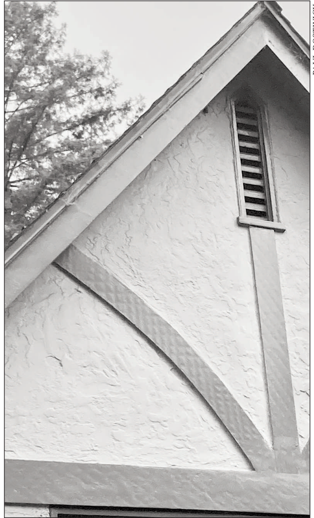
LOOKING CLOSELY at this handsome woodwork reveals hand scalloping on the wooden accent beams

How to recreate that surface design? Source the wide redwood planks? I had to make and replace them all because recreating the surface well enough to blend in with original work was too much to ask (and the rot really was well distributed). What I did is beyond the scope of this article, but in short: I had a mill slice 2x10s (and larger) into my boards and I made spacers to project the thin boards forward. After a long hunt, I found a draw-knife with the appropriate radius to replicate the hewn look of the originals. Then I created a flashing profile, sealed the ends of