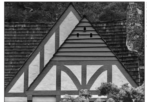
EVEN FROM AFAR , the careful handwork can be discerned.

the planks with epoxy, filled in errors and sanded using a 3D-printed saucer. Then lots of paint (and yes, some splinters.) Finally, I eased the new boards into the old cavities.