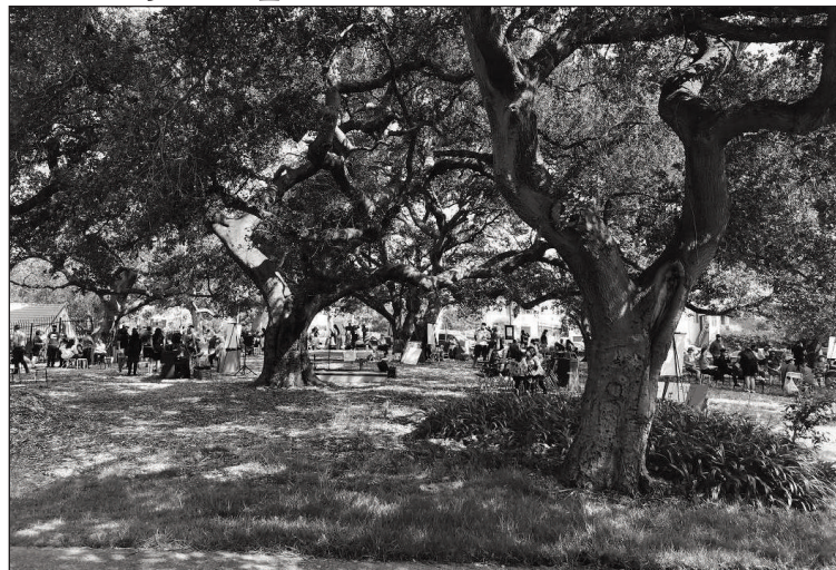
FRIENDS OF SAN ANTONIO PARK

During the course of the community engagement process FOSAP recommended expansion of park programming, a communi-