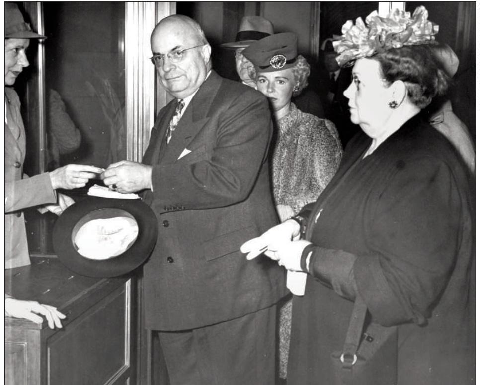
HENRY J. KAISER and his wife Bess arriving at the San Francisco Opera House in 1945 for the opening session of the meetings that led to the founding of the United Nations. This Acme Newspictures photo is from the author's personal collection.