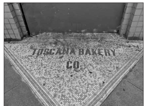
TOSCANA TILE TEASER! See page 12.