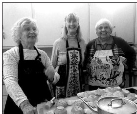
TEGNER LODGE #149's Swedish-born members baking semlor in the Bjornson Hall kitchen.