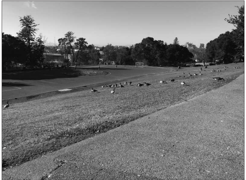
SAN ANTONIO PARK MASTER PLAN RESOURCES