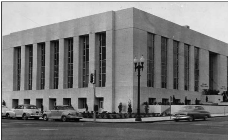
HISTORIC MAIN LIBRARY , designed by Miller-Warnecke, architects, on the day of its dedication in January 1951.