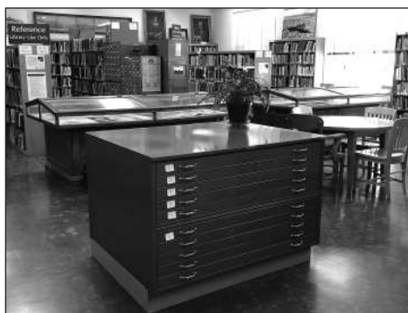
THE HISTORIC MAPS CABINET , newly installed in the Oakland History Center.