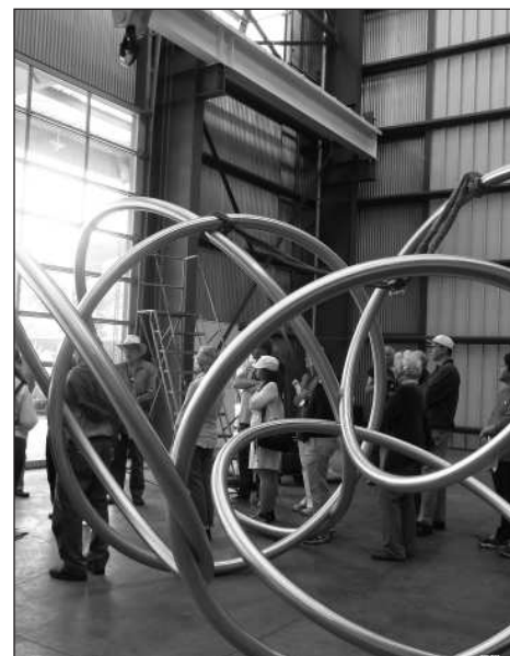
OHA TOUR in West Oakland visits Bruce Beasley's studio, 2015