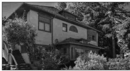
1020-22 BELLA VISTA AVE.