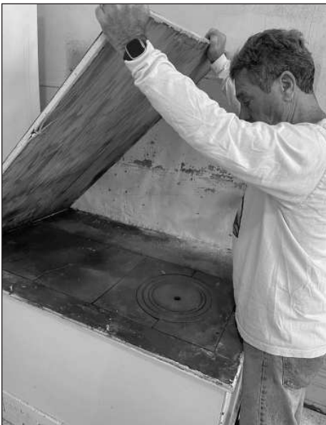
LIFTING THE TOP revealed an even older stove top, hidden since 1925.

■ Kitchen discoveries: We started with the kitchen; it could finally get the deep cleaning