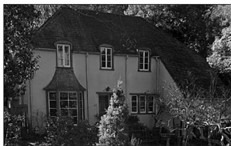
901 TRESTLE GLEN ROAD

Challenges included securing the building, which had suffered major intrusions, graffiti, and deterioration. Recently, the developers have been resculpting the acreage with earthmoving, grading, building-site preparation, and a big stream restoration at Rifle Creek. To move the club, a roadway had to be constructed and foundations prepared. Many companies have been involved, including Evergreen Company, Garden City Construction, Scott Heavy Movers, with monitoring by historic preservation architects Carey & Company/TreanorHL. ■