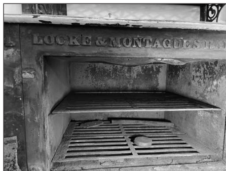
PERHAPS LUCKILY , the old stove hadn't been cleaned before sealing it up, so it provided intriguing clues. At top right, the pipe is evidence that this kitchen stove at some point furnished heated water upstairs.

No one still alive had never seen what was under this. We removed the cabinet (under the clock) and unscrewed the plywood that was covering the top. Underneath we found cast iron concentric circles next to a large, cracked cast iron plate on the other side. We