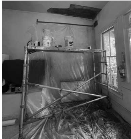
WATER DAMAGE on the ceiling got tackled in a recent effort to shore up infrastructure, above. At right is an ad from the 1930 Sacramento Bee .

■ Other discoveries and mysteries: When you look inside this range, you’ll notice that there is a 12-inch bar of metal in the back and a broken piece of an iron on the left and a tin from Ghirardelli’s chocolates in the front. I think maybe the heat in the oven wasn’t warm enough in the back, so the extra metal helped regulate the temperature. Who knows?