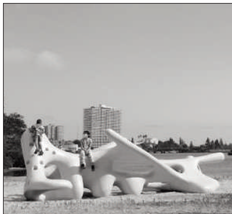
OUR LOVEABLE MONSTER never hurt anybody