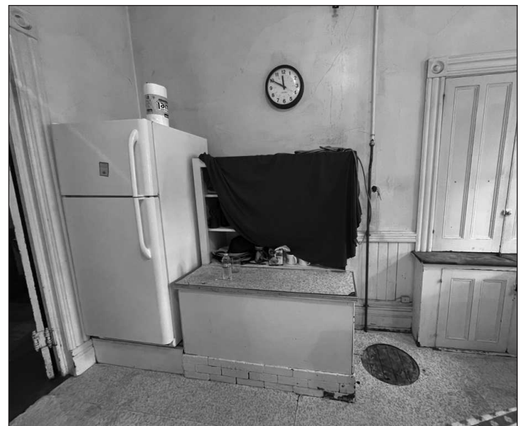
THE COUNTER next to the fridge hid the old coal range.