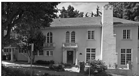
671 LONGRIDGE ROAD

To find out more about Oakland’s Mills Act program, visit: https://www.oaklandca.gov/resources/historic-preservation ■