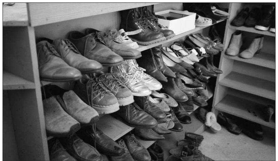
SHELVES OF SHOES: The Glenview Shoe Repair shop dates from an era when people would fix shoes and keep them going longer, rather than discarding them and purchasing a new pair so quickly.