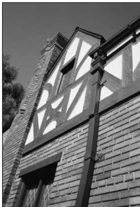
FAUX TUDOR detailing and mullioned windows make the Glenview Shoe Repair and others in its retail strip charming places to visit.

Change was tough on the shoe repair business. Back in the day, everyone wore leather shoes that needed repair. Men and women used to bring their leather shoes in for professional treatment at Joe’s place. That changed with the rise of synthetic “throw away” shoes. Business dropped off, and the pandemic dealt the coup de grace.