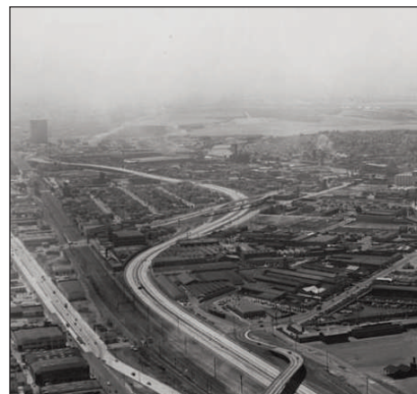
OAKLAND HISTORY CENTER

Now it appears that there may be money to remove I-980, and plans for this space (equivalent to 13 city blocks) abound. There