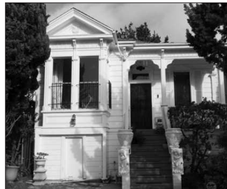
CITY OF OAKLAND