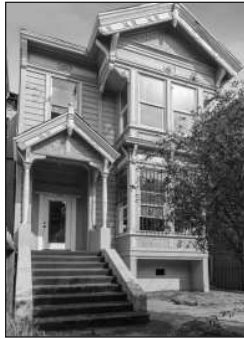
1120 CHESTER ST.