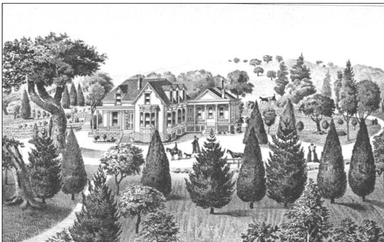
FERNWOOD ESTATE in its heyday.