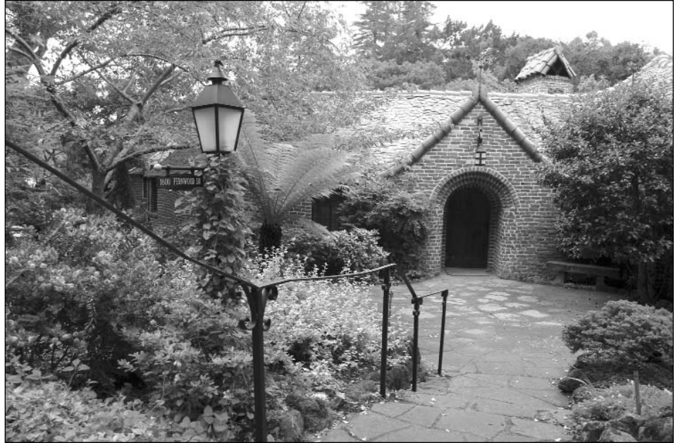
ONE OF THE CHARMING HOMES in the Fernwood neighborhood today.