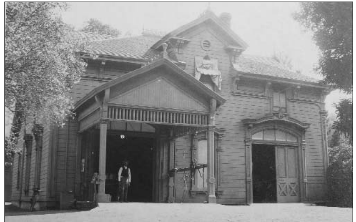
A "SIMPLE" CARRIAGE HOUSE on the Fernwood estate.