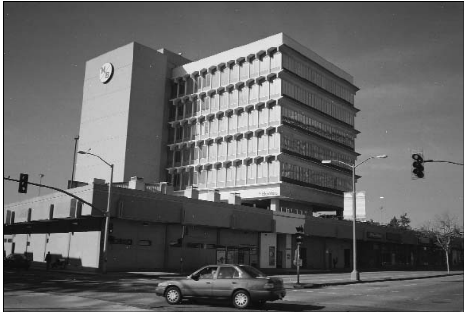
ONCE CONSIDERED GROUNDBREAKING , the M/B Center has seen better days . . . but won't have any at all soon. Demolition is underway.