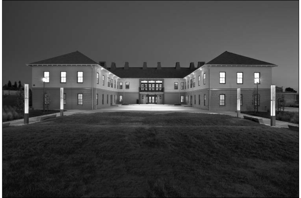
A NEWLY-WELCOMING FACADE at Studio One Arts Center.

Rehabilitation has created a new use compatible with an arts center. Now the space reaches out to the neighborhood. The