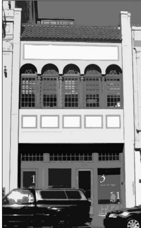
BEAUTIFUL ROMANESQUE DETAILS gleam once again on the restored facade at 1631 Telegraph Ave.