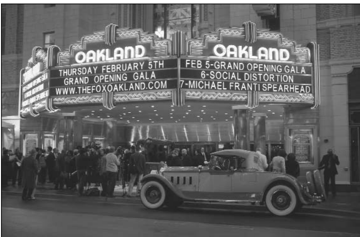
RED CARPET ACTION at the Fox Theater grand opening gala.

The focal point was a history exhibit researched and designed by volunteers