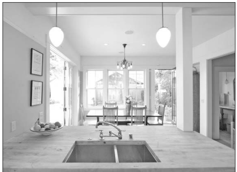
THE KITCHEN at 4924 Webster St., originally a barn.