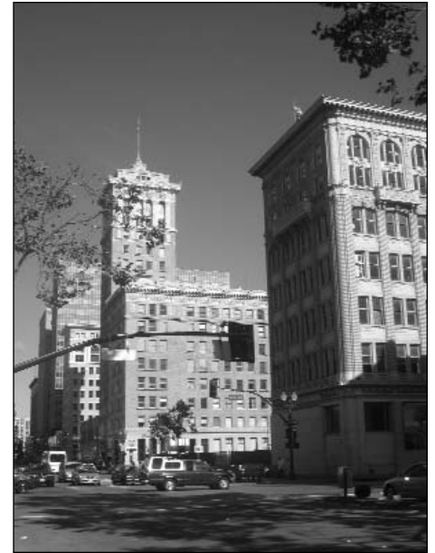
HOW WILL OAKLAND'S downtown National Register District be protected?