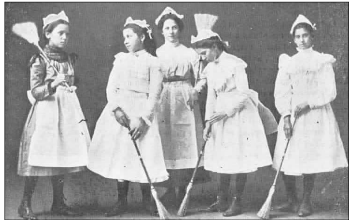
THE BROOM BRIGADE of the Oakland New Century Club.

As time went on, the club recognized the need to provide recreational opportunities in Oakland Point and added a lending library and reading room, and carpentry and gymnastics classes. In 1911, the club built a gym