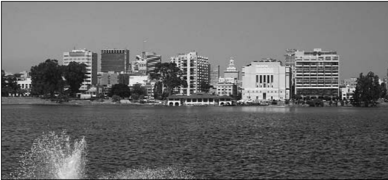
SHOULD OAKLAND ESTABLISH VIEW CORRIDORS? City Hall and the Tribune Tower are visible from the 18th Street Pier.