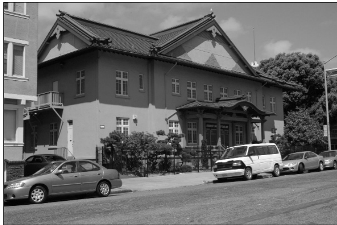
THE BUDDHIST TEMPLE at 825 Jackson St. was cut in half to move it from its original location three blocks away.

Like most Japantowns, Oakland's Nihonmachi included community halls, bathhouses, a Buddhist church, Christian churches, markets, nurseries, laundries and gakuens