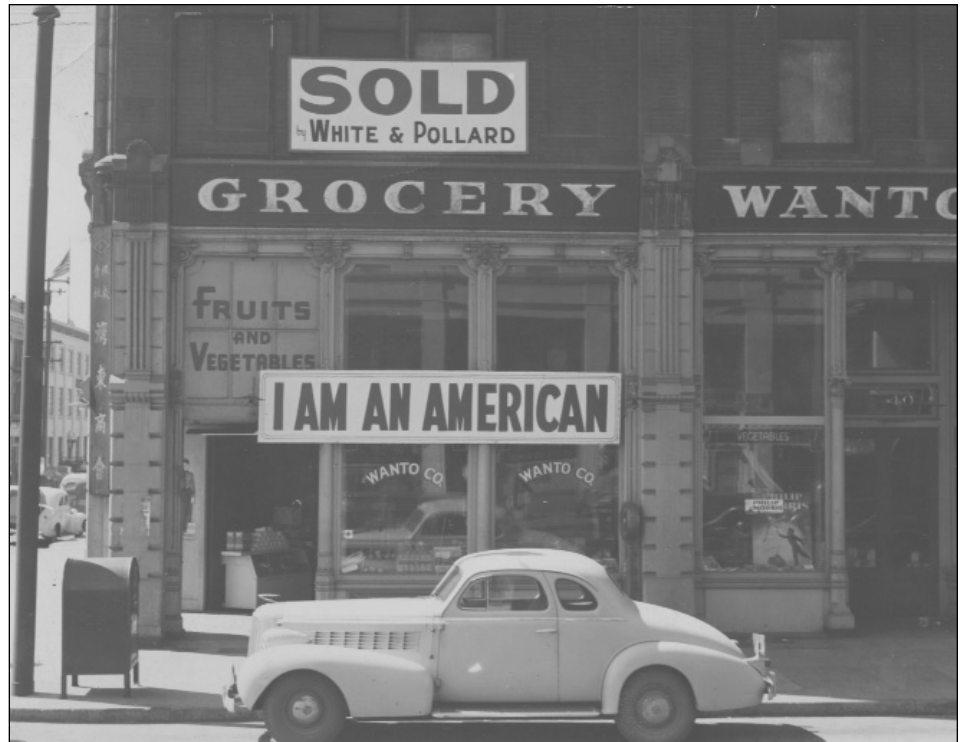
DOROTHEA LANGE'S photograph of Wanto Co. Grocery's storefront, 1942.

At the time, people worried that the 9/11 attacks would ignite profiling of Muslims and Arab-Americans. Not ironically, Japanese-Americans spoke up quickly. The Japanese American Citizens League drew a historical parallel between the attacks and Pearl Harbor, hoping to minimize backlash against Americans of Middle Eastern descent.