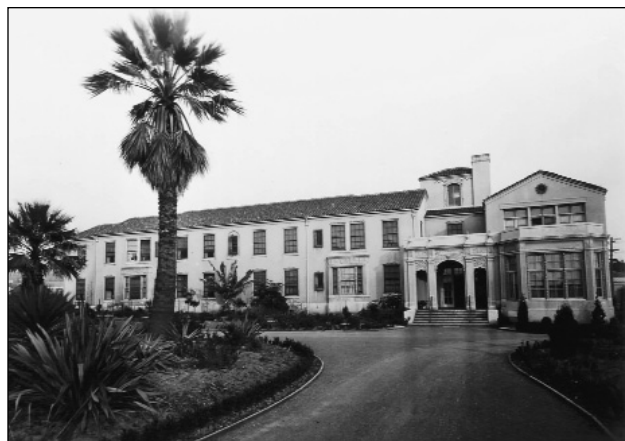
THE MATILDA BROWN HOME IN 1931.

While Park Day cannot use the Matilda Brown Home building for classrooms yet, they are already using the site for meetings. "The public rooms are already in constant