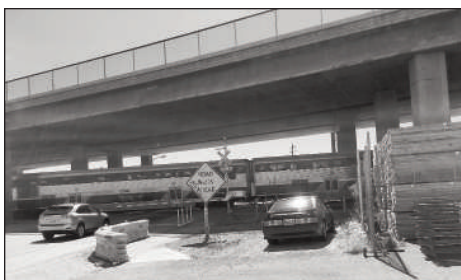
SINCE THE 19TH CENTURY , Oaklanders have been cut off from the waterfront by rail and later, freeway.