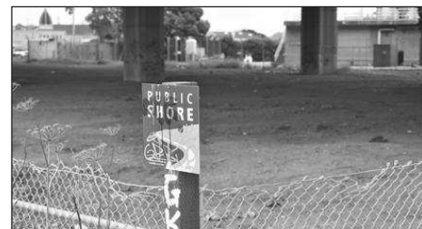
ALL THREE: NAOMI SCHIFF