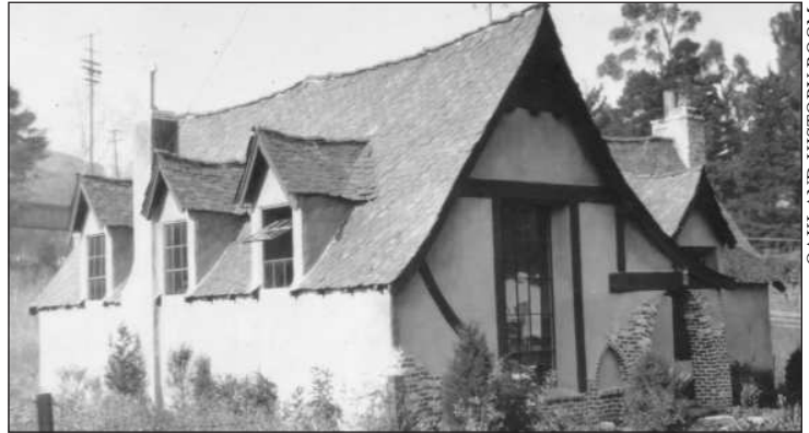
OAKLAND HISTORY ROOM

In the early 1960s, a community-led effort resulted in funding to add a Children’s Room and patio at the rear of the original building. Contributions were solicited and received from residents and from every area business and organization. This effort raised $15,000 by 1965, and the city council matched funds