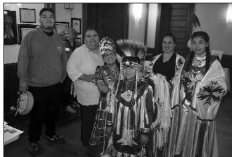
DANCERS , drummers and leaders from the Intertribal Friendship House.