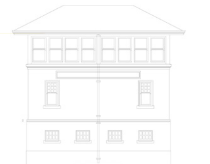
WOOD STREET ELEVATION | EAST