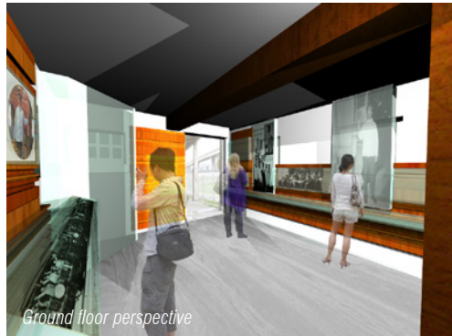
Ground floor perspective