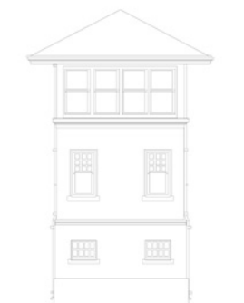
TRAIN DEPOT ELEVATION | NORTH