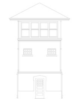
WEST GRAND ELEVATION | NORTH