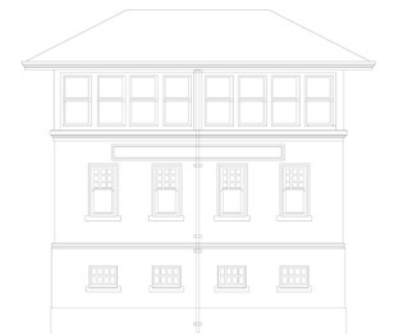
FRONTAGE ROAD ELEVATION | WEST