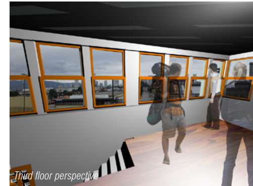
Third floor perspective