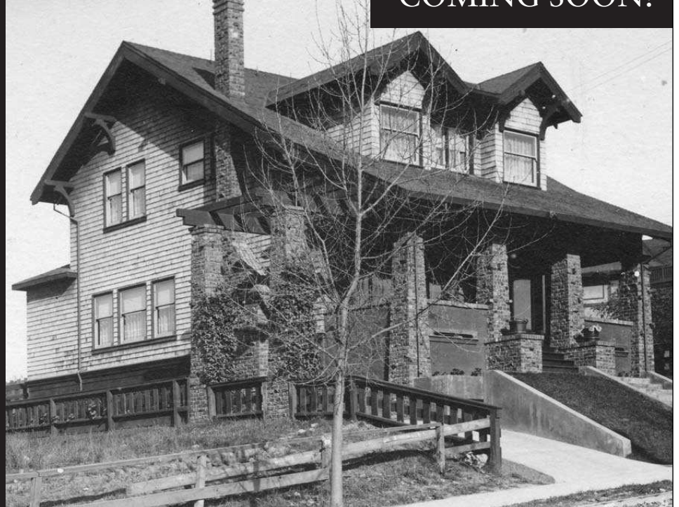
from a 1915 Postcard