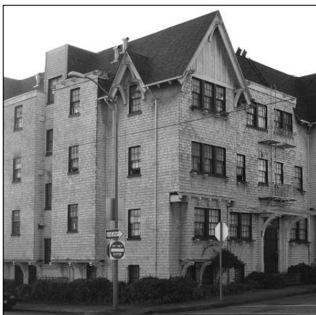
THE A-RATED 1910 Newsom apartment building stands on a prominent corner.

We and the Audubon Society also objected that the plan called for waiving Oakland’s dark-skies standards and encouraging uplighting and large lit signage, despite the area’s proximity to Lake Merritt—a key bird sanctuary, and an important wintering and rest stop on Pacific bird migration routes. ■