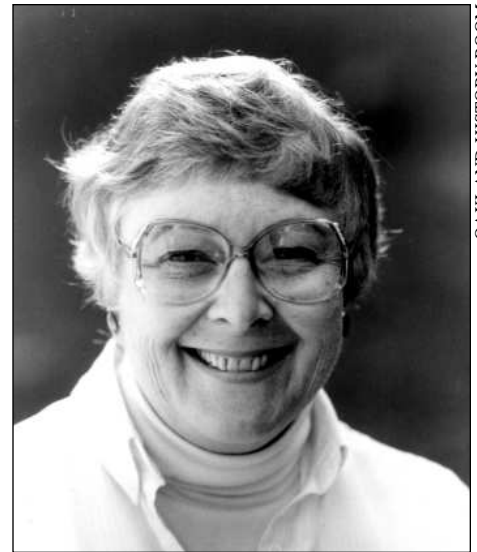
OAKLAND HISTORY ROOM

With strong ideas about citizens' rights and justice, no fear, and a wicked sense of humor,