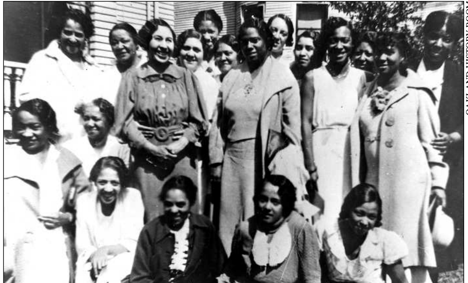
OAKLAND HISTORY ROOM

The Linden Street staff responded with a continuous roster of services such as free meals, housing, and job training and placement services to the homeless and the