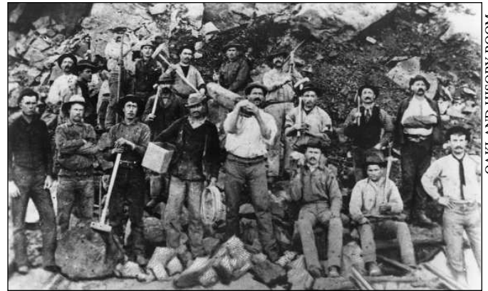
ITALIAN QUARRYMEN at Bilger Quarry, 1898.

Why is the old quarry filled with water now? The Claremont spent another $8,500 to turn it into an irrigation reservoir by diverting a branch of Glen Echo (formerly Cemetery)