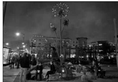
PUBLIC ART: Children’s Fairyland, left, and the Uptown Art Park.